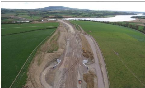
Underpass U01 in Co. Kilkenny in foreground with Pink Rock in background.