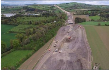
Cut 3 - Rock blasting and earthworks site