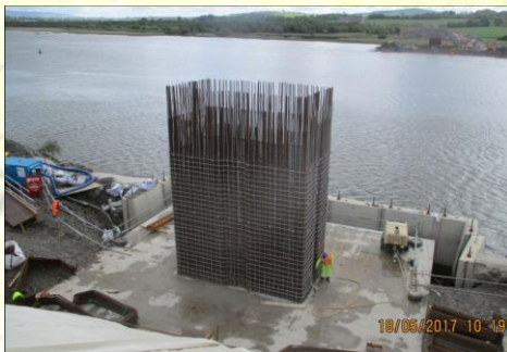
Barrow Bridge – Pier 3 base following concrete pour.