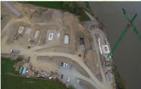
Barrow Bridge - Piers 1, 2 & 3 at Pink Rock on Kilkenny side of river.