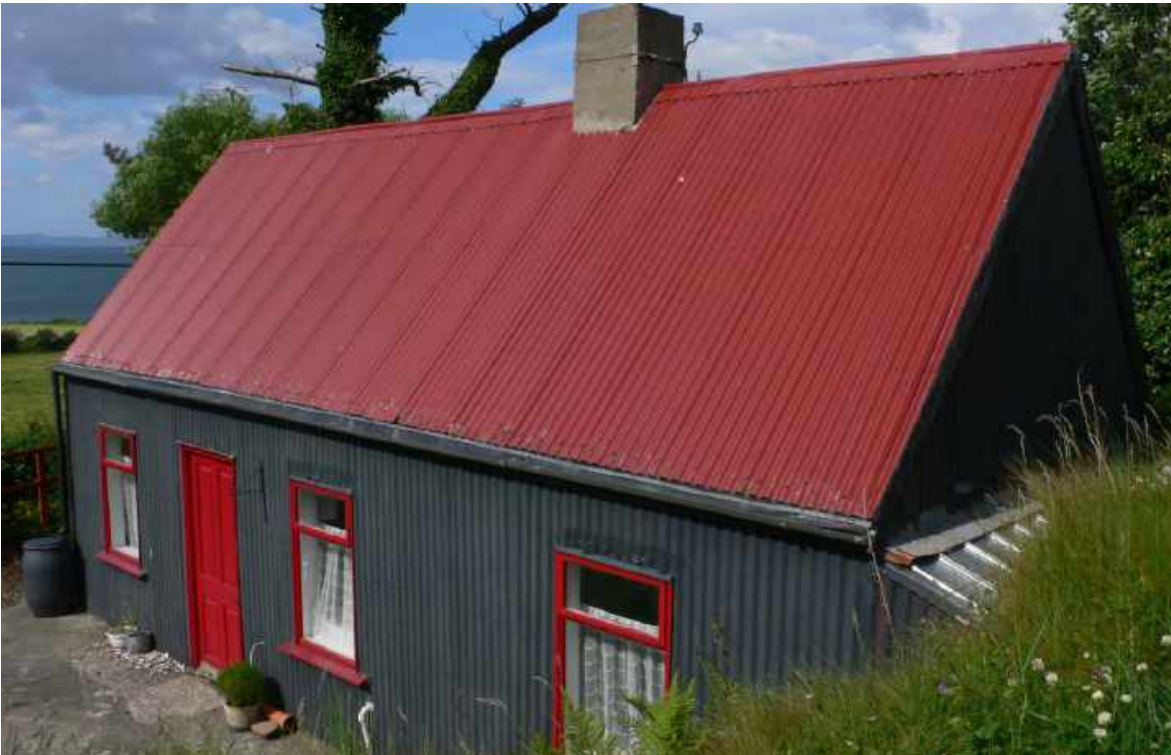
House of vernacular plan form and appearance, but with walls and roof clad in corrugated iron, near Camp, Co. Kerry (Barry O'Reilly)

Locally-made brick is found in some districts, later displaced by brick made in industrial quantities elsewhere, but tended to be used only in chimneystacks and perhaps door and window surrounds. Some other industrially-produced materials, such as tar and felt, have been absorbed into the built vernacular heritage.