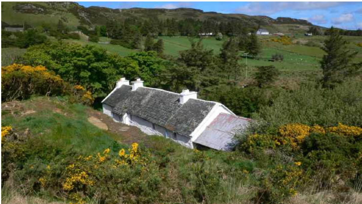
House with Roshine Slate roof and bed outshot, near Dunfanaghy, Co. Donegal (Joe Gallagher/Greg Stevenson)

Many vernacular materials are claimed to have excellent qualities in terms of climate adaptation and resilience. Thick clay walls, for example, are often said to provide a cooler interior in high temperatures and a warmer interior in low temperatures, the low window-to-wall ratio keeping the interior insulated from extreme changes in temperature; thatch is also generally regarded as an excellent insulator. In the Irish context, there is a need to critically assess these qualities of vernacular buildings.