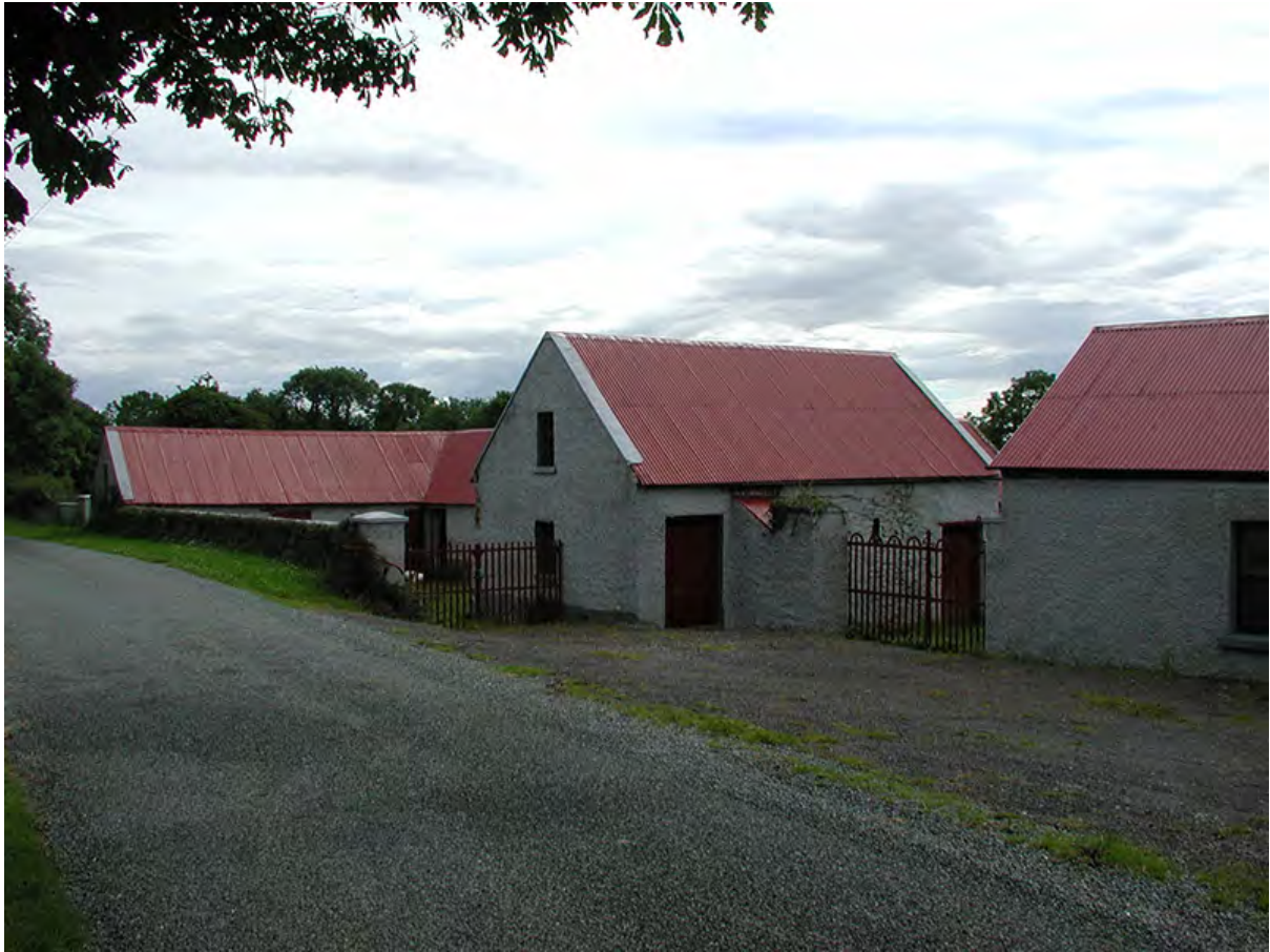
Well-sited farm buildings, near Rathfeigh, Co. Meath