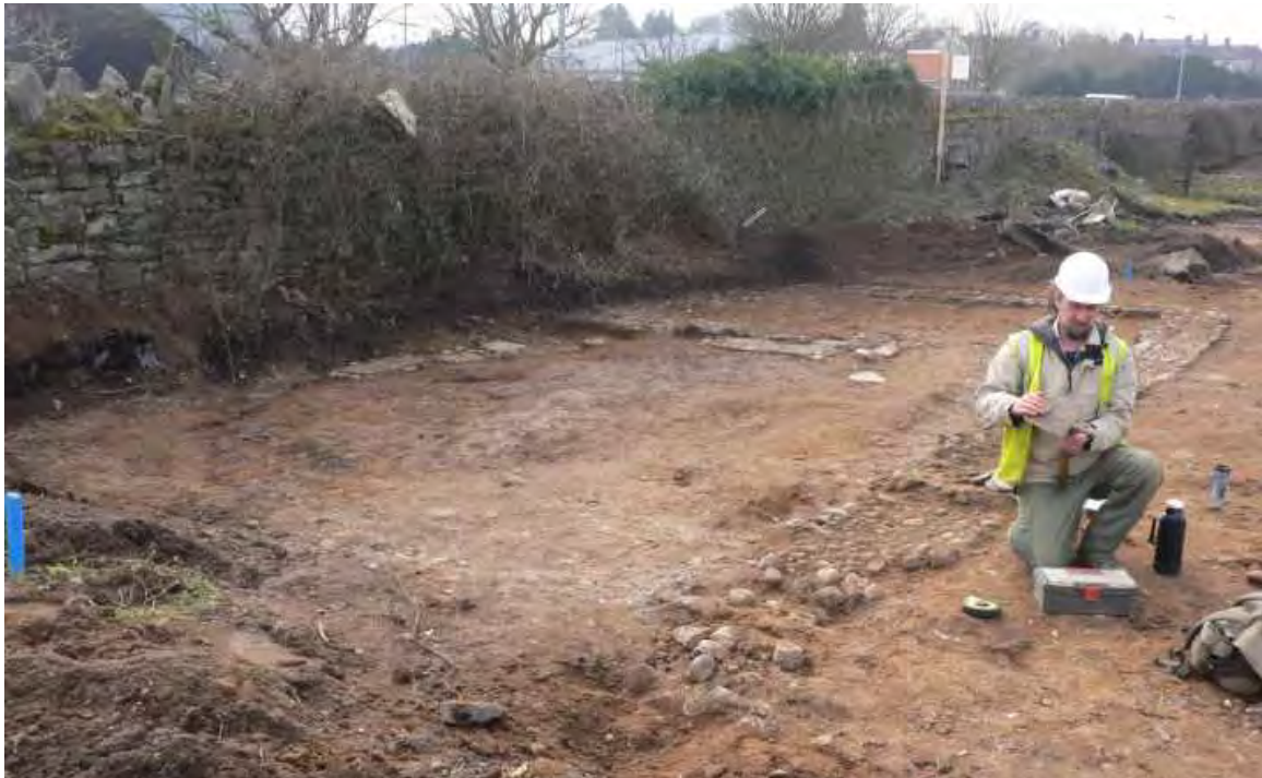
Archaeological excavation of two-roomed house, Tipperary Town (Barry O'Reilly)

Also, that 'Assessment and analysis of the potential for sensitive adaptation and re-use of existing buildings and landscapes including historical/vernacular settlement patterns, and the re-use of building materials needs to be mainstreamed in the development process' (p.45). It should be noted that incorporating ideas, construction methods and materials from the vernacular into new buildings, while encouraged by this strategy, does not mean that the results are vernacular buildings. The proposed successor, 'Places for People', emphasizes the urgent need to respond to the challenges posed by climate change, a theme that accords well with various objectives of this strategy for our built vernacular heritage.