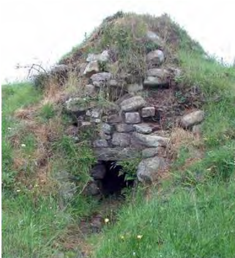
Sweathouse, near Drumshanbo, Co. Leitrim (NIAH)

Some vernacular houses, outbuildings and industrial or other structures are recognized as being of special interest and are protected structures under the Planning and Development Acts, by being included in the record of protected structures drawn up by each local authority. The National Inventory of Architectural Heritage (NIAH), established in 1999, increasingly includes the built vernacular heritage in its surveys and ministerial recommendations to local authorities. Currently, more than 2,000 vernacular structures feature in the Inventory, but their inclusion in local authority development plans has been variable. Holy wells, sweathouses and a few other items are recorded as archaeological heritage under the National Monuments Acts.