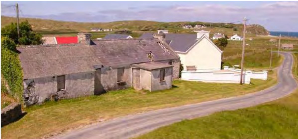
Isle of Doagh, Co. Donegal: before (2010) and after (2013) (Duncan MacLaren)