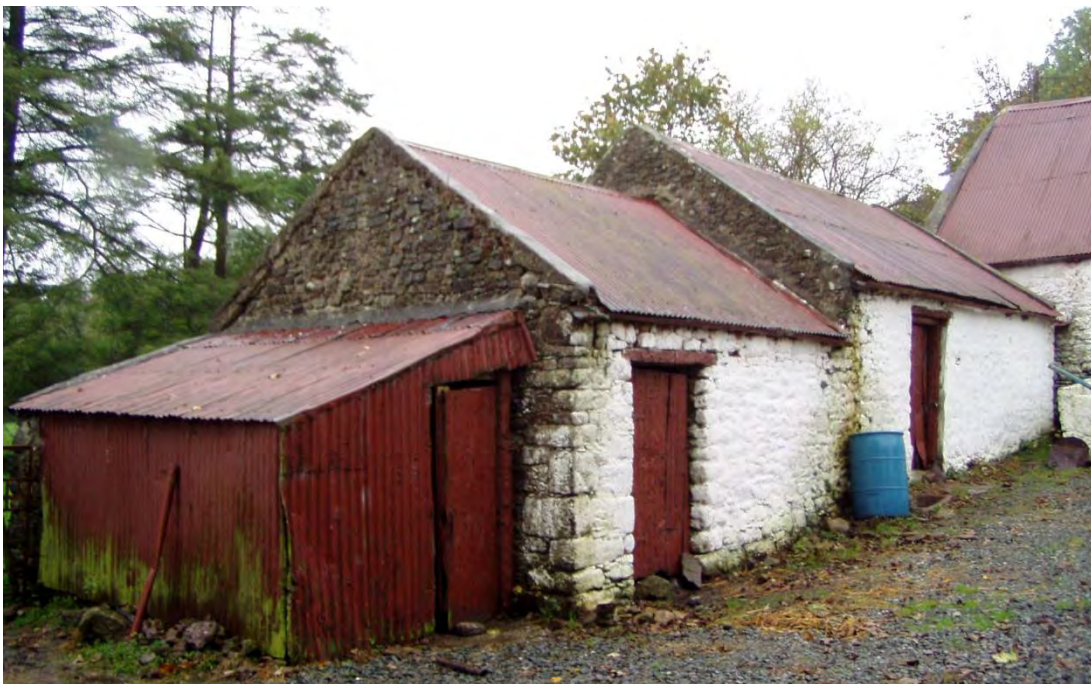
Farm buildings near Kildorrery, Co. Cork

As stated at the beginning of this document, safeguarding and celebrating our vernacular is a sign of maturity, cultural awareness and confidence on the part of a people. The built vernacular heritage not only represents our past and be useful in the present, but can, and should, be part of our future.