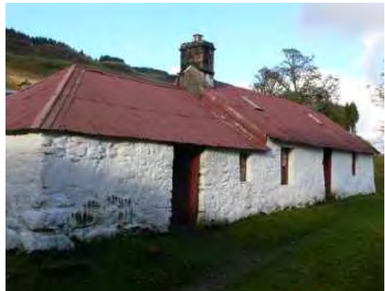
Farmhouse at Auchindrain, Argyll and Bute, Scotland