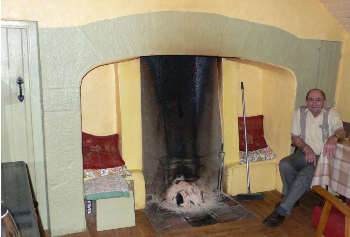
Stone-arched hearth, Menlo, Galway City

The interior of the vernacular house is especially important for understanding the lives and culture of its occupants and their community. The old kitchen and its hearth are, practically and emotionally, the heart of the traditional home.