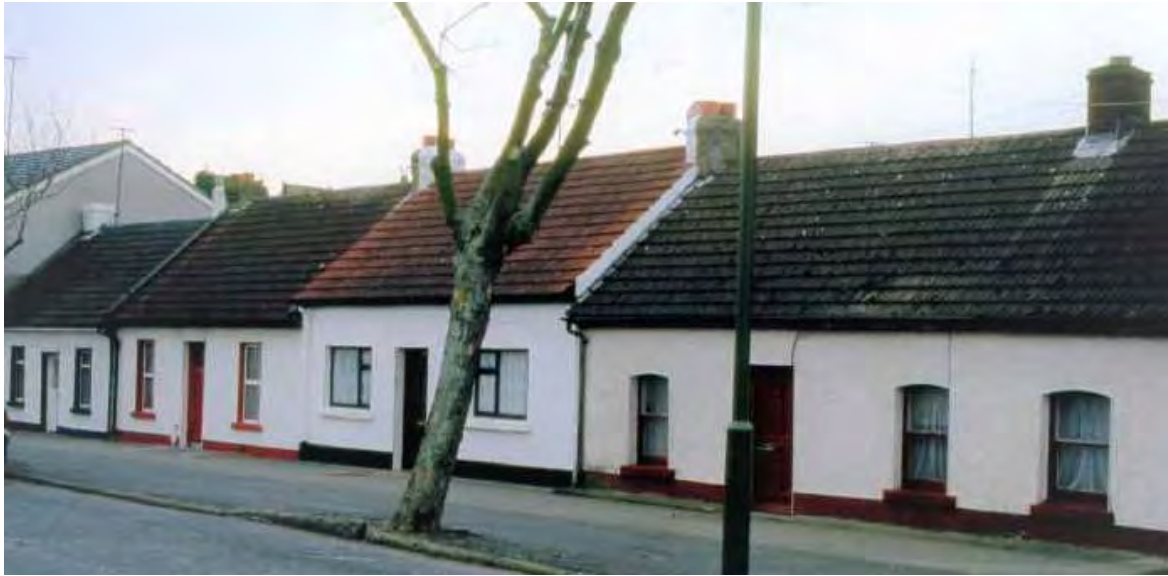
Urban vernacular housing, Strand Street, Skerries, Co. Dublin

While most surviving urban vernacular buildings may date to the late eighteenth or early nineteenth centuries there are probably some that are much older. A clearer understanding of the origins and nature of our urban vernacular is needed. There is much confusion about what is and what is not urban vernacular in Ireland. This is clear from many local authority development plans, in which it is erroneously claimed that the generality of town or village buildings are vernacular. Typical urban buildings are usually not vernacular, nor is most labourers housing.