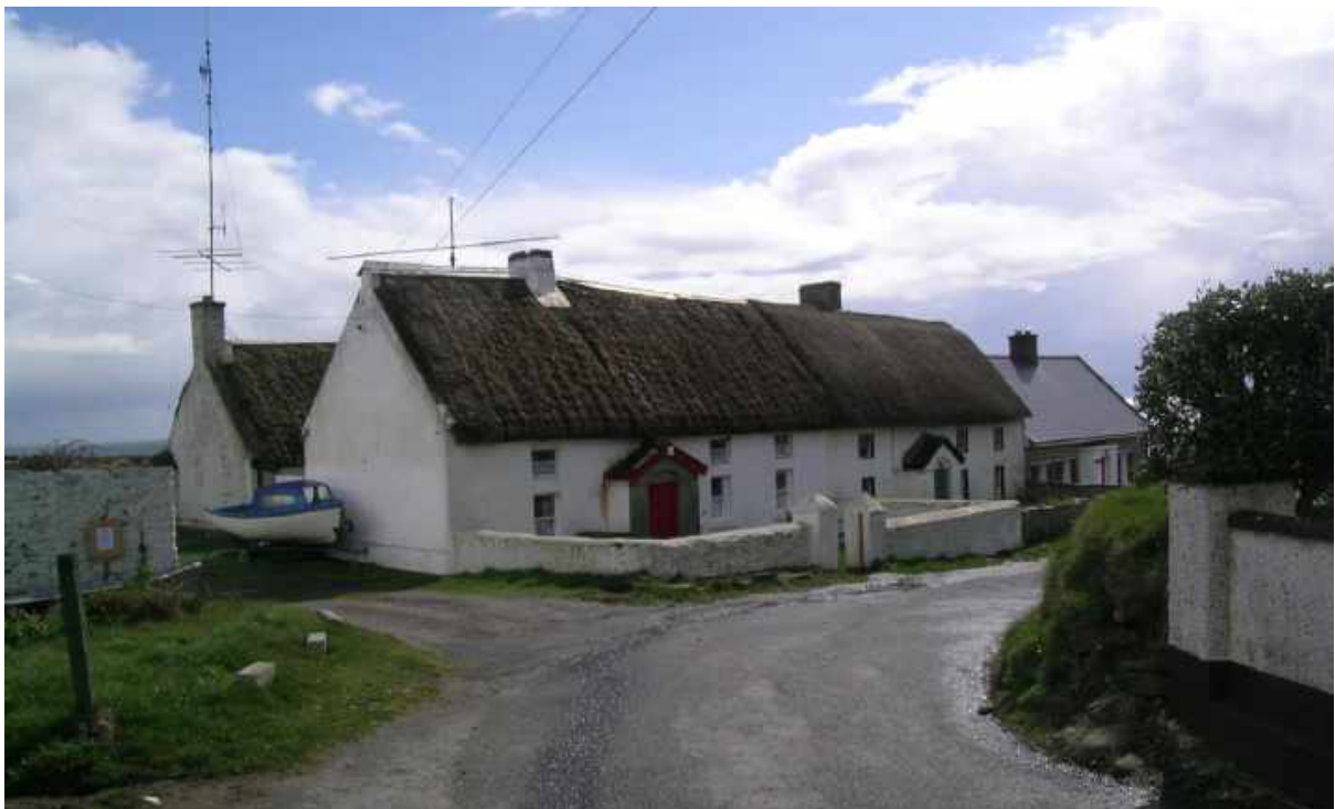
Part of the fishing settlement at Clogherhead, Co. Louth