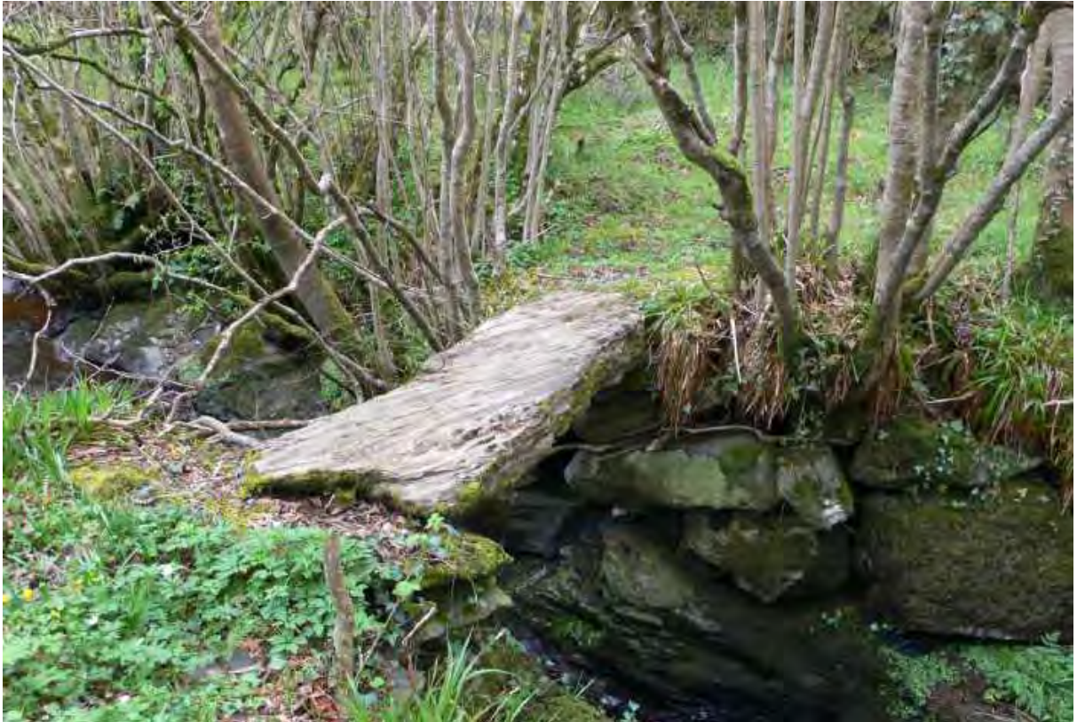
Footbridge, formed by a single slab, across a small stream, near Convoy, Co. Donegal (Barry O'Reilly)