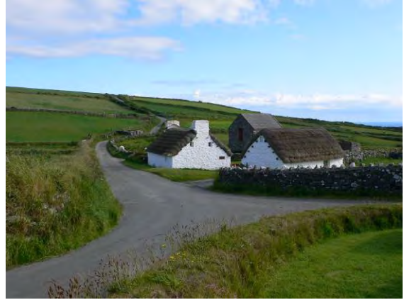
Roped thatched houses at Cregneash, Isle of Man