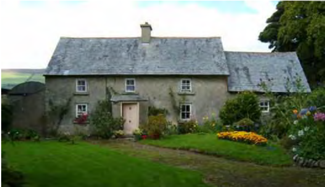
Two-storey farmhouse, near Kilann, Co. Wexford (NIAH)

As part of our response to climate change, and the need to act responsibly to protect our environment, we need to learn what our vernacular can teach us about building wisely, so that we can integrate its many good ideas into contemporary building practice. 23 In time, new vernacular building traditions may emerge.