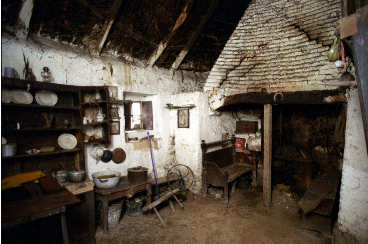
Kitchen interior, Mayglass, Co. Wexford

While present in the landscape as buildings and other features, the built vernacular heritage is also, importantly, a significant part of our intangible cultural heritage, as recognized by UNESCO in its 'Convention on Intangible Cultural Heritage' (Paris, 2003):