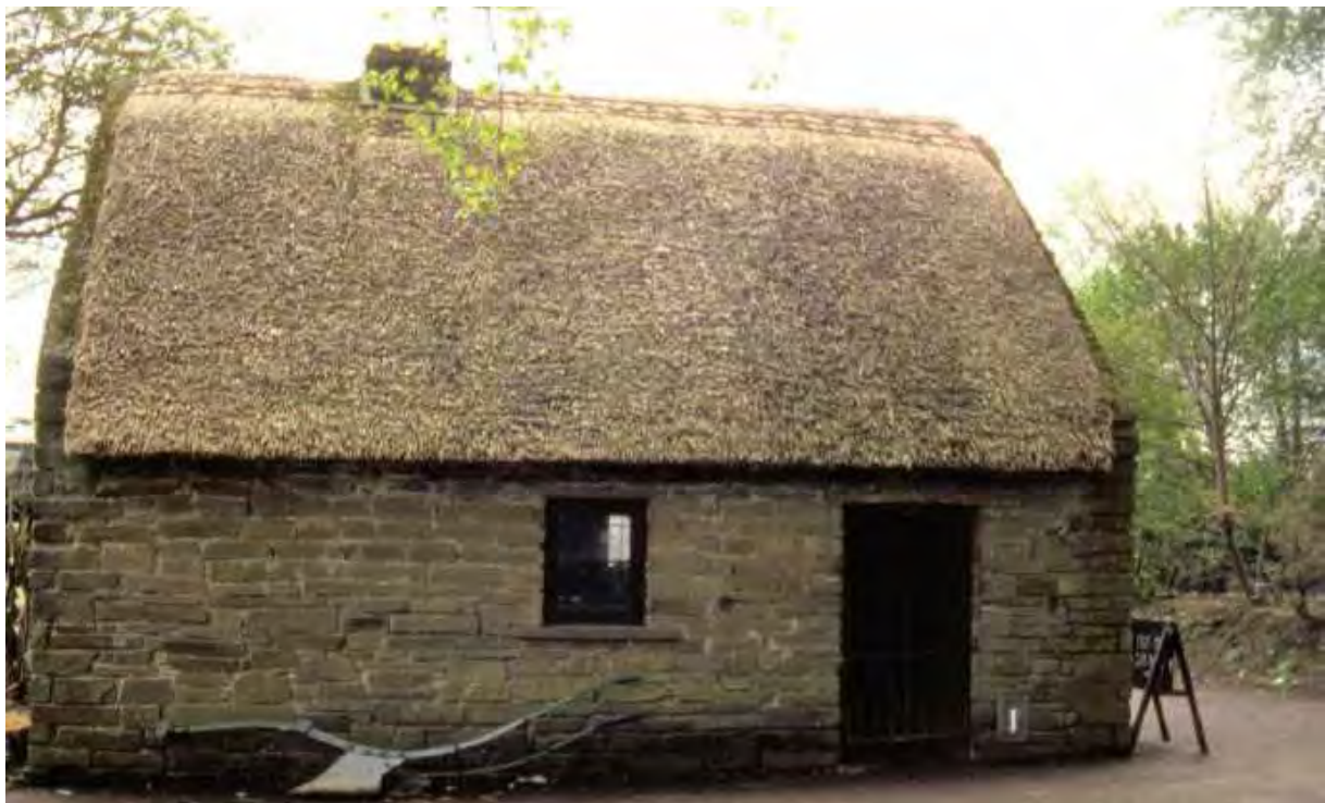
Forge at Bunratty Folk Park, Co. Clare

The Irish Agricultural Museum at Johnstown Castle, Co. Wexford and Muckross Farm, Killarney, Co. Kerry also have important collections.