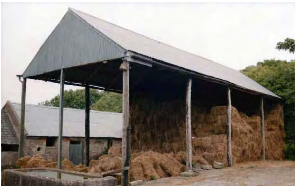
Hay barn of informal construction, near Barringtonsbridge, Co. Limerick

In general, there has been significant positive change over the last two decades, with vernacular buildings increasingly featuring in local authority Records of Protected Structures, operated under the Planning Acts. At the same time, there has been an improvement in the inclusion of built vernacular heritage in about one-third of written statements in local authority development plans.