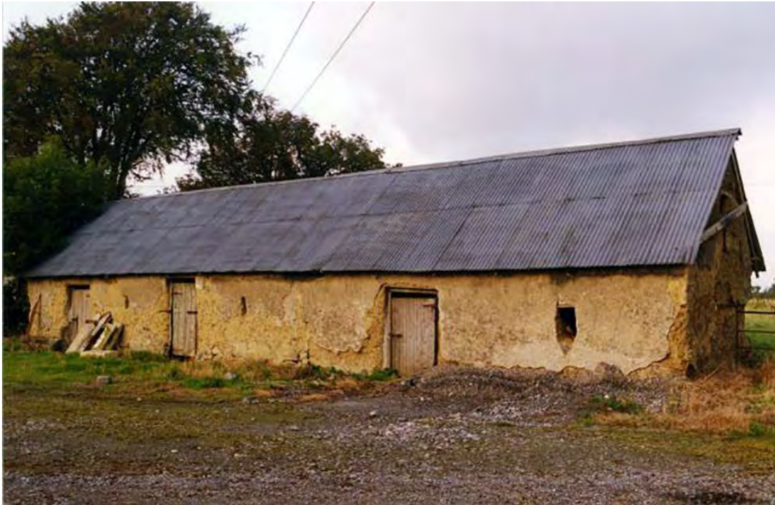
Farm building with mud walls, near Geashill, Co. Offaly (Barry O'Reilly)

From about the mid-nineteenth century, improvements in transport infrastructure led to the universal availability of industrially produced materials, often brought long distances or imported from abroad. This led to the increasing marginalization of the older materials and methods, and some age-old construction techniques, such as mud-walling, largely became extinct.