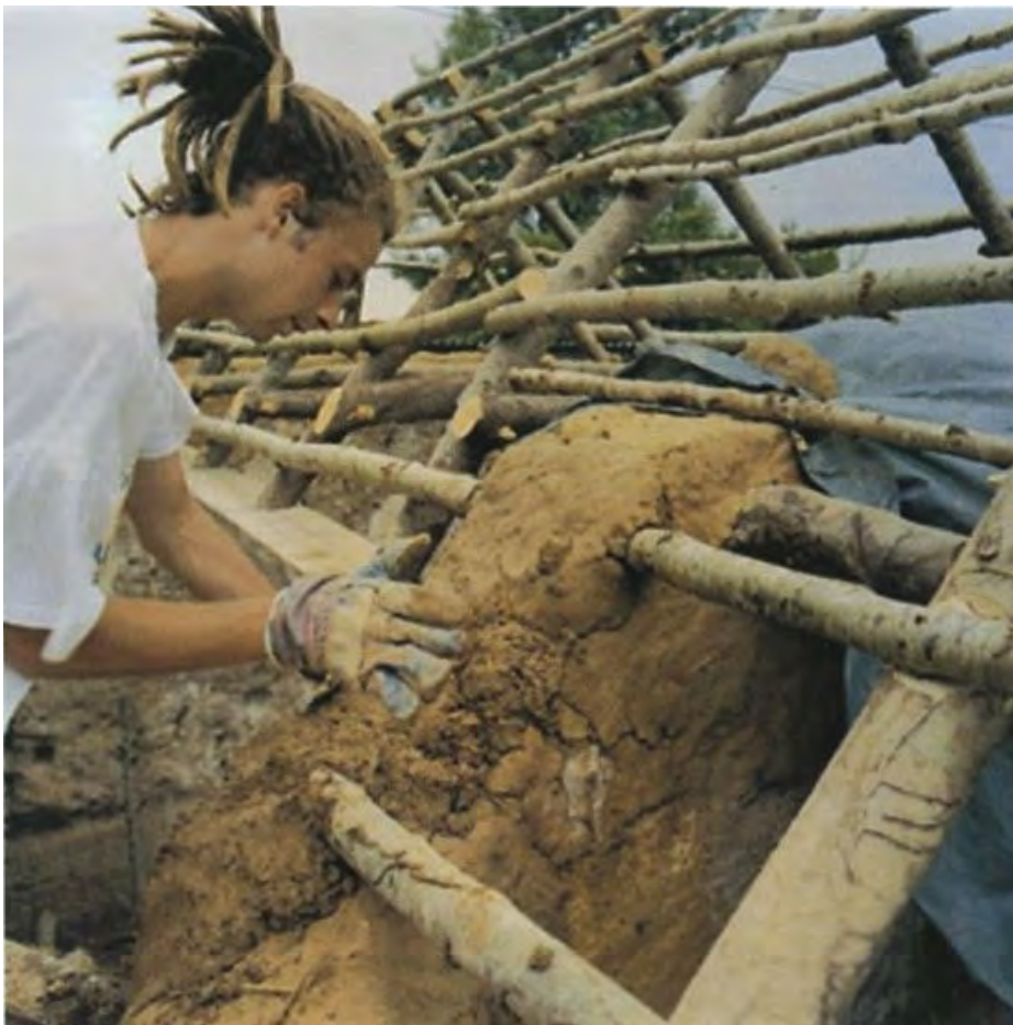
Repairing mud walling, Mayglass, Co. Wexford (UCD)

Rediscovery of the wisdom of vernacular builders offers an exciting challenge and opportunity in an era when it has never been more vital to reduce our carbon footprint and to reconnect with ways of building that reflect local and regional environments and building cultures.