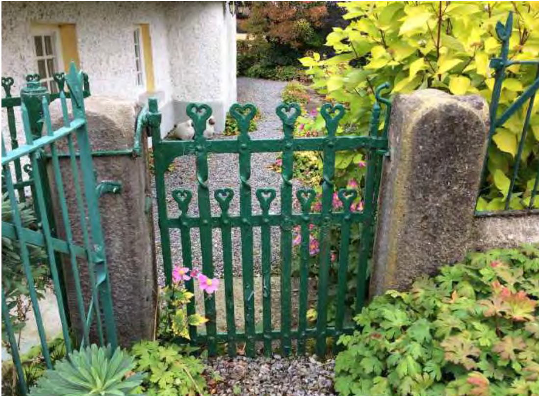
Pedestrian gate to house, Geashill, Co. Offaly