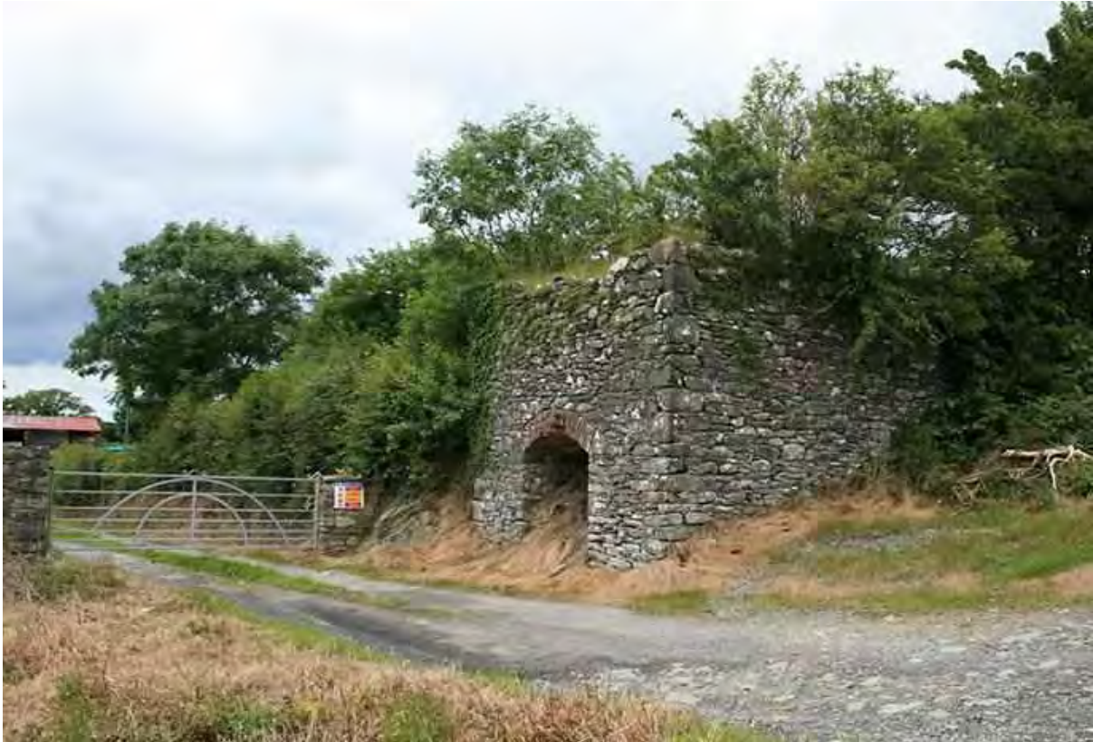
Limekiln, near Tonyduff, Co. Cavan (NIAH)

Vernacular houses are indeed different, but they can be made more comfortable — doing this in a way that doesn't compromise the building is the key to success.