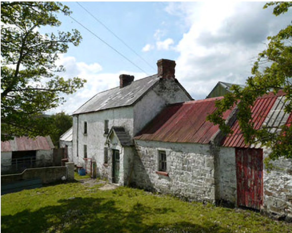
Farmstead, near Carrickmacross, Co. Monaghan

The word 'vernacular', as applied to architecture, is used to describe buildings and structures that are, or were, conceived and built by 'ordinary' people, as distinct from rulers and others exercising authority. 6 Such buildings are part of an informal approach to architecture and the landscape, largely operating outside formal architecture, being deeply rooted in traditional ideology and characterized by ideas and techniques passed down within communities and families. The earliest vernacular buildings in Ireland were constructed by our Mesolithic ancestors in the eighth millennium BCE. Our oldest standing vernacular buildings date to probably no earlier than about the year 1600.