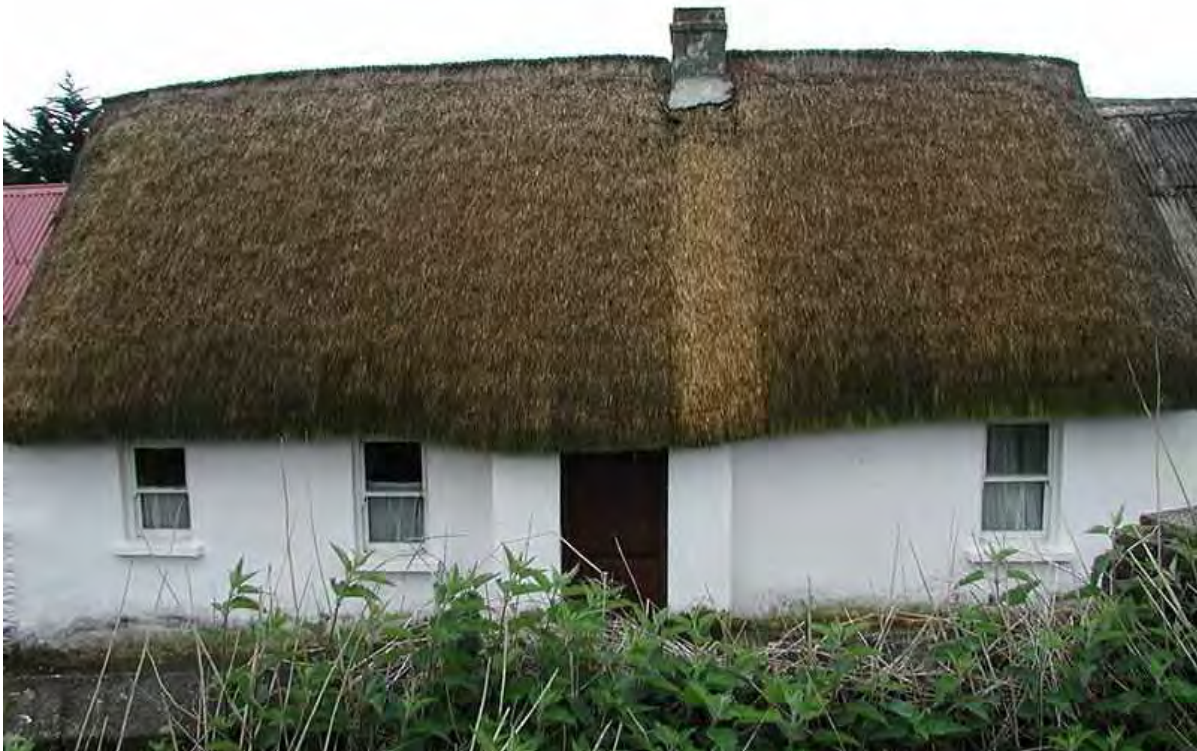
Straw-thatched vernacular house, near Rathkenny, Co. Meath

There is a need for more effective co-ordination between State bodies, local authorities, the thatching trade/craft and building owners to ensure that thatchers, materials and grant assistance are available when they are needed. Review of the effectiveness of the various grant schemes is important. The supply of thatching materials has often been problematic and ways to address these effectively are needed.