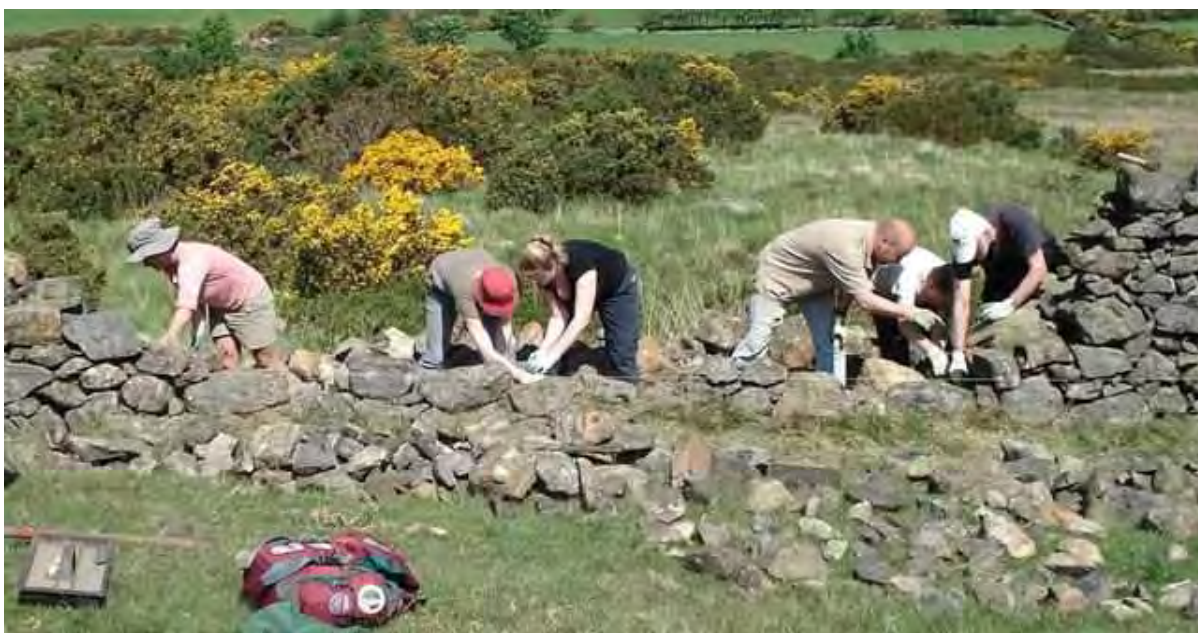
Volunteers repairing field wall, Mourne Mountains, Co. Down

Ulster Architectural Heritage has also done a great deal to highlight our built vernacular heritage, especially through their 'Buildings at Risk' publications and their casework.