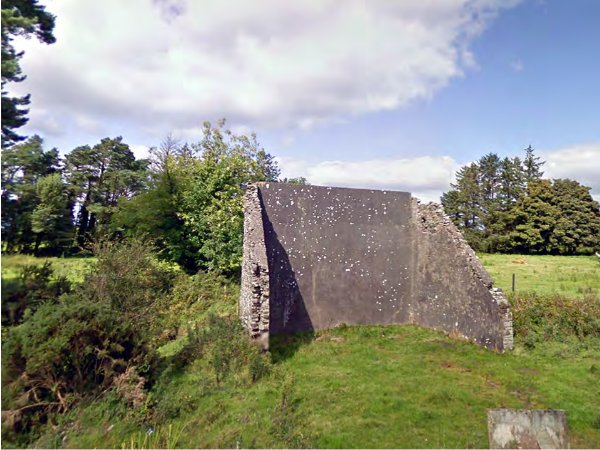
Ball alley, near Charlestown, Co. Mayo