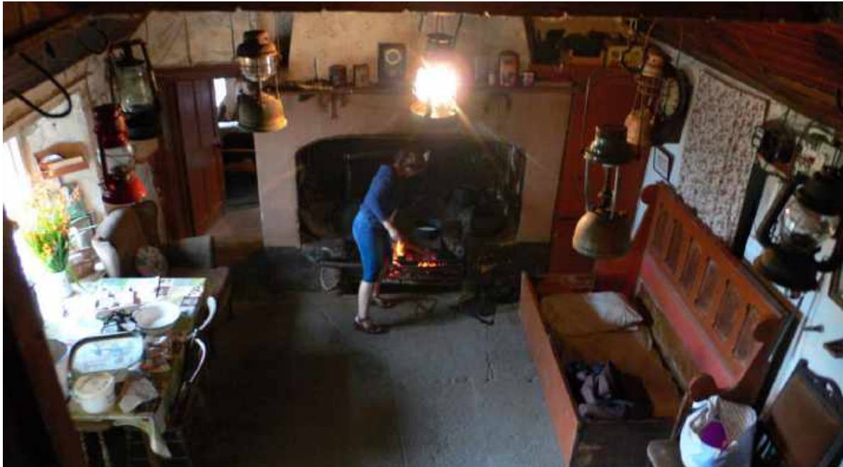
A notably intact vernacular kitchen, near Kilcormac, Co. Offaly

In short, the vernacular house cannot be understood or appreciated by looking simply at its form or construction. It is always vital, in addition to the utilitarian uses of houses and other buildings, that we acknowledge the importance of folk traditions.