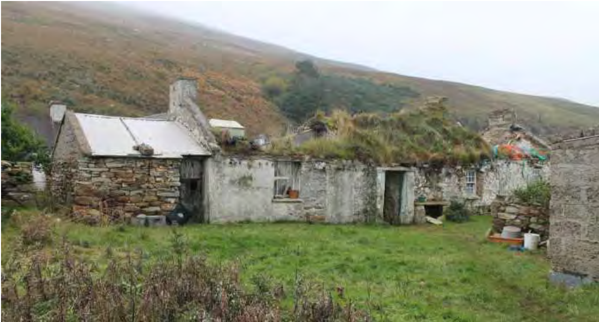
Lenankeel, Co. Donegal: before (2015) and after (2018) (Duncan MacLaren)