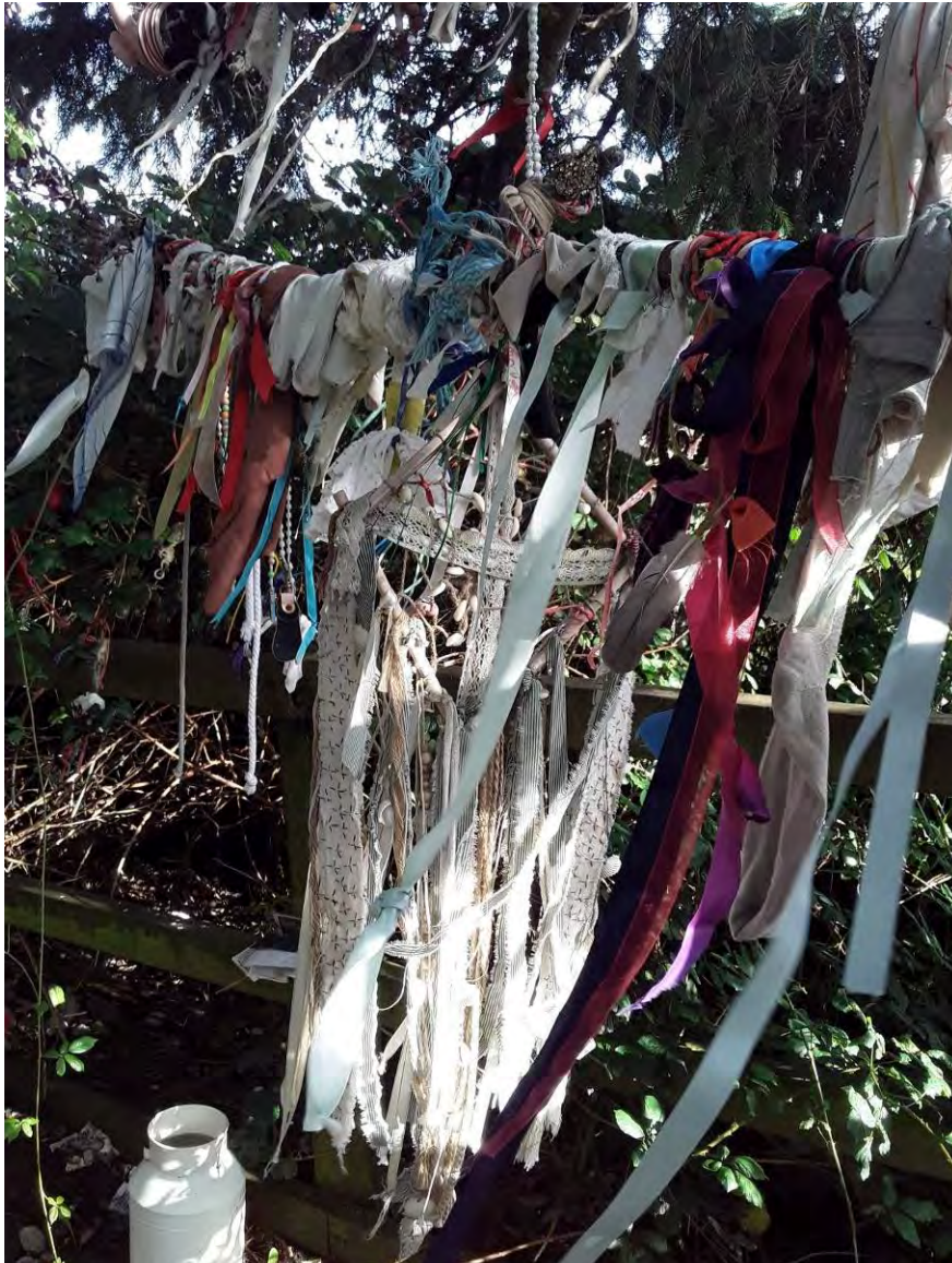
Rag bush, St Brigid's Well, Tully East, Kildare, Co. Kildare (Barry O'Reilly)

Our built vernacular heritage represents a tangible link with the living and working places of our forebears, and displays their unselfconscious creativity and utility. The built vernacular heritage is a key cultural layer in our rural landscapes and in some of our more urban ones. It is no less valuable or important to our cultural heritage than our archaeological monuments or our formal architecture. Its loss in any particular place or district is detrimental to that locality's sense of place. Our built vernacular heritage also connects us with traditional societies throughout the world and is, therefore, part of a shared global tradition, which can enhance our human understanding and compassion.