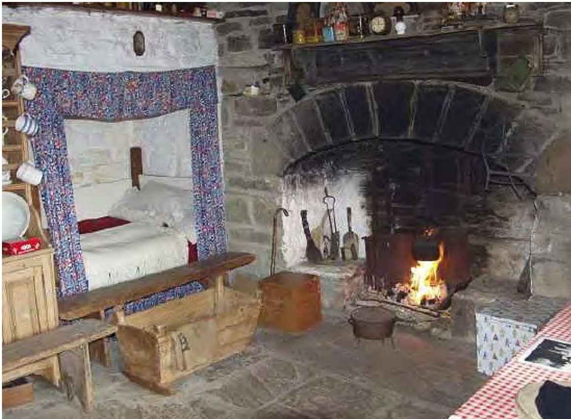
Kitchen, showing hearth and bed outshot, Hennigan's Heritage, Killasser, Co. Mayo (NIAH)

The National Library of Ireland and the Ulster Museum also hold relevant archival material, in the form of historic photographs, and the latter and the National Gallery of Ireland have holdings of paintings and drawings of landscapes and interiors.