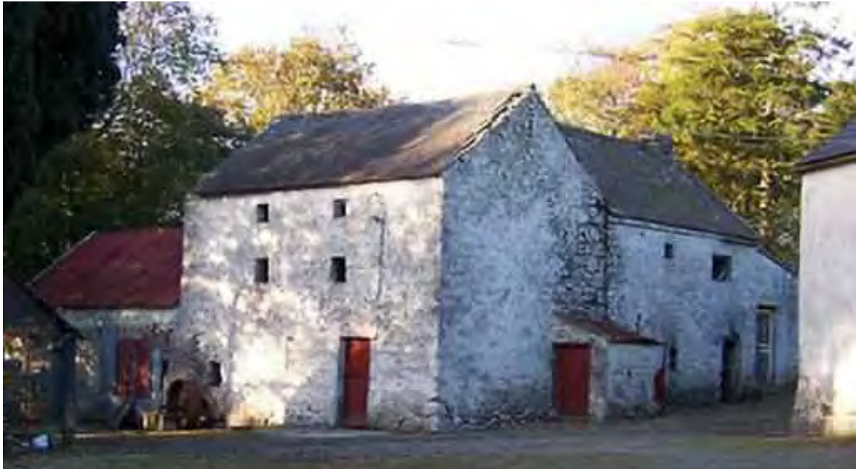
Watermill complex, near Horseleap, Co. Westmeath (NIAH)

Vernacular buildings must evolve, as they always have, with their owners and their changing circumstances. However, today there are two constraints that were generally absent heretofore – one, the need to embrace sustainability in all its facets and secondly, the need to conserve what is a unique legacy of homegrown architecture, all the while adapting it for our own era. It should be possible to devise and present a variety of ways of adapting or extending vernacular houses that do not undermine their traditional character by, among other approaches, drawing on the methods that people in earlier eras have used to alter or extend their houses.