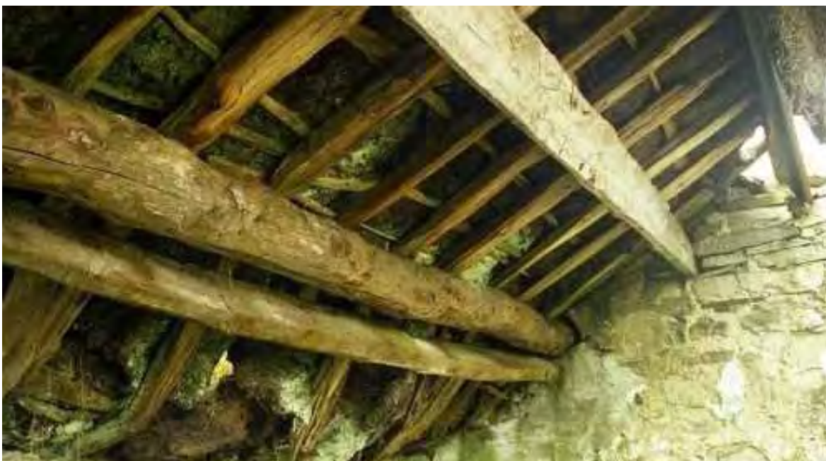
Historic thatched purlin roof structure, near Mullaghmore, Co. Sligo (Barry O'Reilly)

The emphasis of the strategy for built vernacular heritage, in relation to thatch, must be on appropriately skilled thatching work for historic thatched roofs and the buildings they cover. It is important that all those involved in decision-making for thatched roofs, especially in the awarding of grants and inspection of buildings for this purpose, are appropriately trained. Grants for the repair of thatched roofs have been available since 1990, but at present only apply to buildings that are primary residences; other grant schemes can fund a wider range of thatched structures.