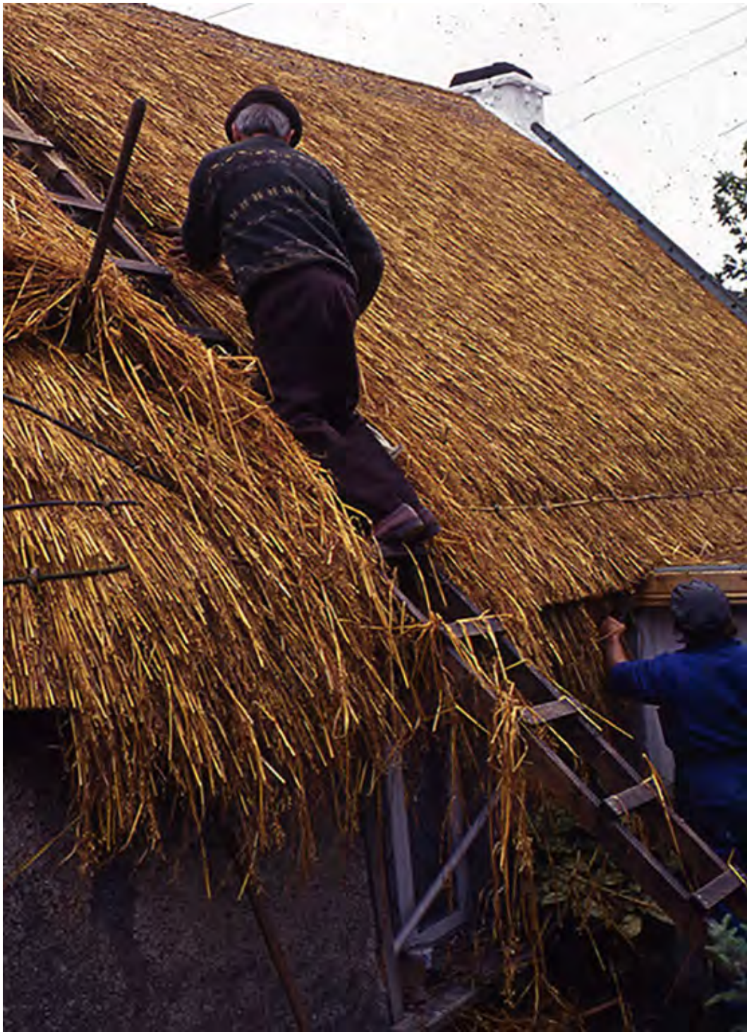
Thatchers at work, Swords, Co. Dublin