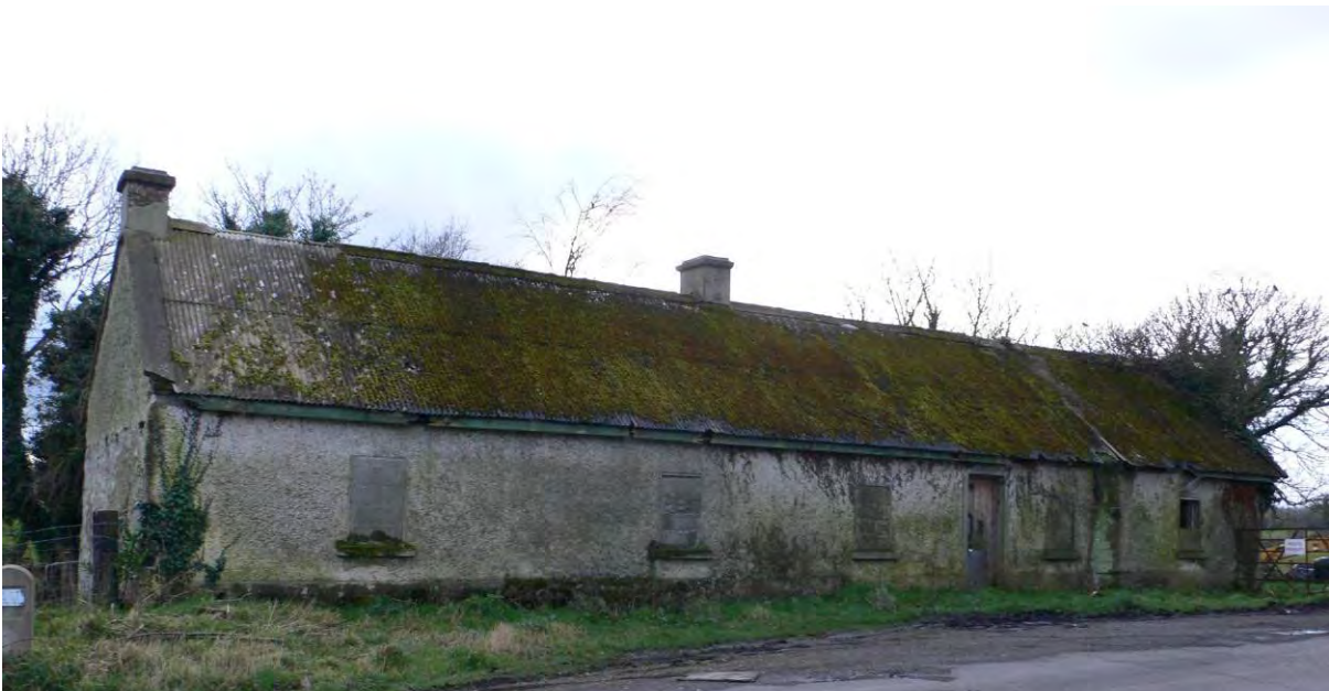
Derelict vernacular building, near Mountmellick, Co. Laois