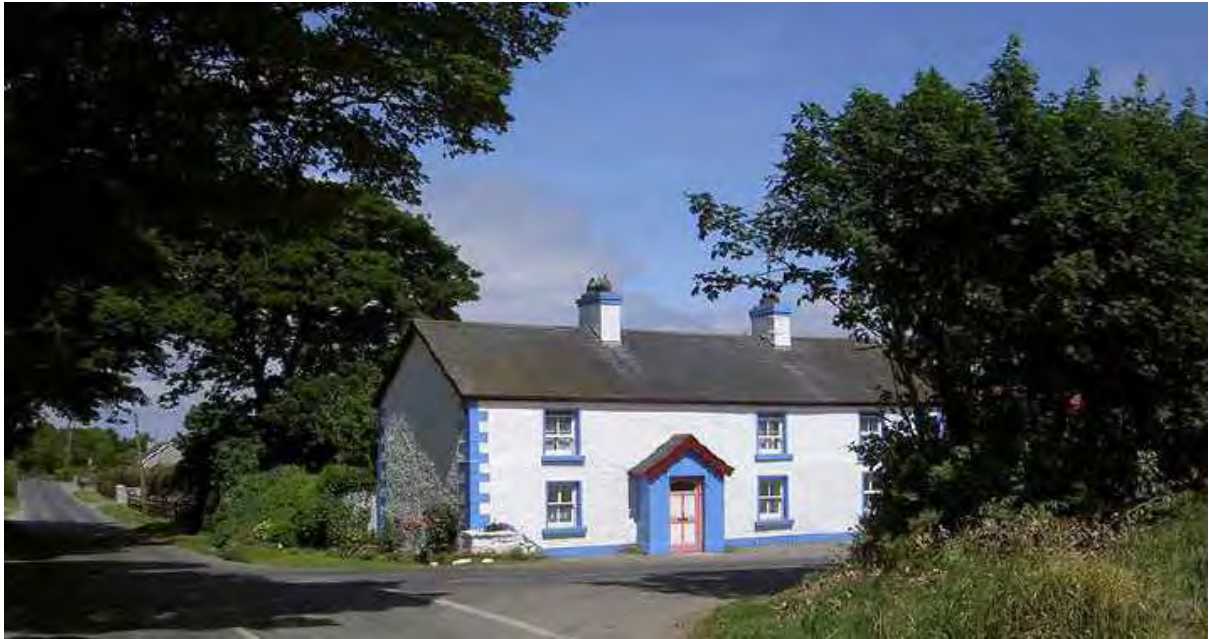
Farmhouse adding visual interest and sense of place to its locality, near Togher, Co. Louth (NIAH)

Heritage Ireland 2030 includes an action to ‘Promote our vernacular built heritage and support associated traditional skills.’