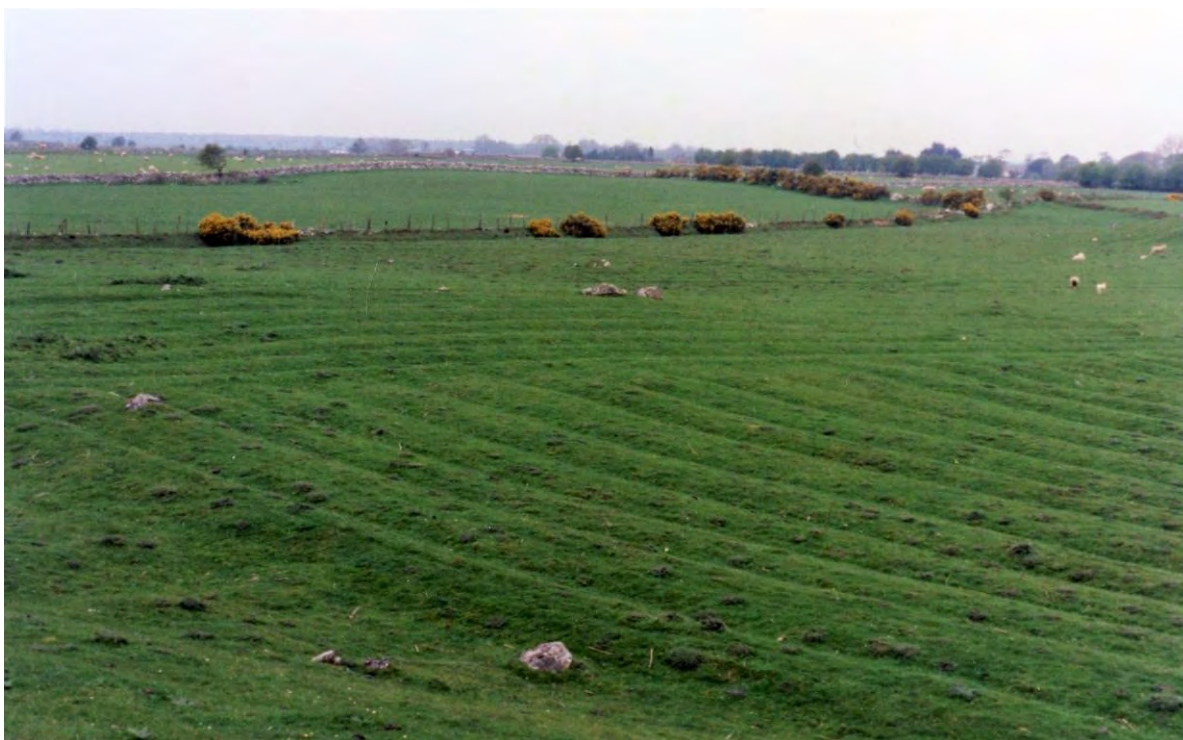
Abandoned tillage, Rindoon, Co. Roscommon (Barry O'Reilly)

Rediscovering the intrinsic importance of the built vernacular heritage to a given locality is important for community identity, pride and wellbeing. Maintaining the built vernacular heritage will sustain the viability of traditional craft skills and local employment. A landscape, rural or urban, whose vernacular has been understood and cherished is a landscape that is attractive and culturally significant for local and visitor alike. It also contributes to sustainable local economies and social cohesion.