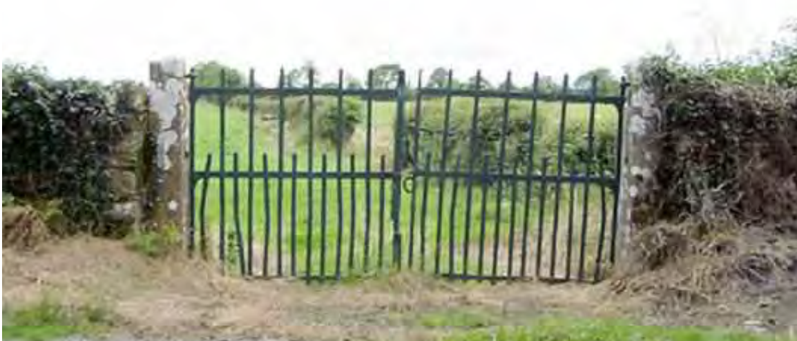
Field gate, near Tang, Co. Longford (NIAH)

Wrought-iron gates made by local blacksmiths often have details that identify these craftsmen and tie the gates very directly into their immediate locality. Such gates are an important and often overlooked part of our vernacular and craft heritage and should be retained in situ. At this stage, even some factory-made gates, made in the likeness of older examples, have become rare and are worthy of consideration. Both types of gate have been superseded by mass-produced tubular steel gates having little or no variation, to facilitate modern farm machinery. Stiles, into fields or located to one side of a gateway are also distinctive local features, mainly in stone, but sometimes in timber. It is important that planning requirements for refurbishment, adaptation or extension of vernacular houses do not result in the loss of important site features, such as mature trees, boundaries and gates.