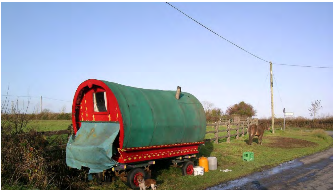
Barrel-topped wagon, near Fethard, Co. Tipperary (Barry O'Reilly)

The built vernacular heritage includes churn stands, farm and field gates, wells, old potato ridges, booley (transhumance) sites, field boundaries and gates, forges, mills and kilns, penal chapels, mass rocks and holy wells, children's burial grounds, trees, bushes and stones with traditional associations, currach pens, piers and kelp stacks, sweathouses, clapper bridges, Travellers' wagons and tents, ball alleys and fair greens, vernacular settlements (mainly farming hamlets, sometimes called 'clachans'), fords, mass paths and old (often disused) routeways, but also many, many more items.