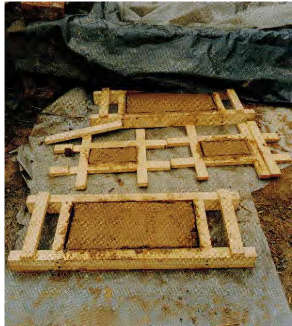
Mud bricks, formed in wooden moulds, were used to repair decayed parts of the mud walling (Heritage Council)

The Irish Folklife Division of the National Museum of Ireland, based at Turlough Park, near Castlebar, Co. Mayo, manages the national collection of objects reflective of Irish traditional life. It collects and stores objects and also exhibits a large collection of traditional artefacts and building craft tools.