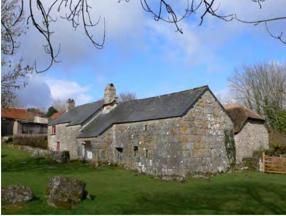
Longhouse at Lettaford, Devon, England

The built vernacular heritage occupies a central place in the affection and pride of all peoples. It has been accepted as a characteristic and attractive product of society...It is utilitarian and at the same time possesses interest and beauty. It is a focus of contemporary life and at the same time a record of the history of society...It would be unworthy of the heritage of [humanity] if care were not taken to conserve these traditional harmonies. 1