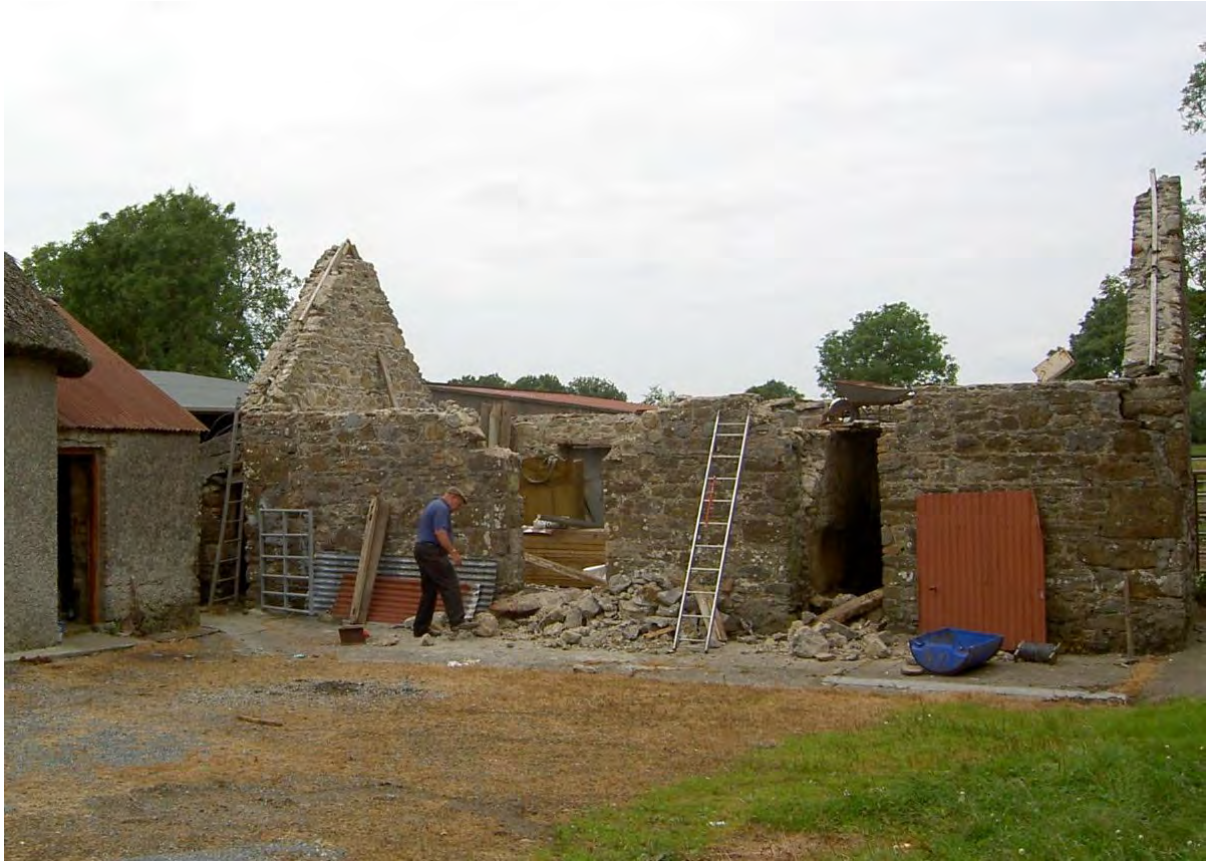
Farm building under repair, near Moyvore, Co. Longford (NIAH)

The Town and Village Renewal Scheme (2016) and the 'Action Plan for Rural Development' (2017), operated by the Department of Community and Rural Affairs and the Islands, also provide frameworks within which work that can benefit the built vernacular heritage can take place.