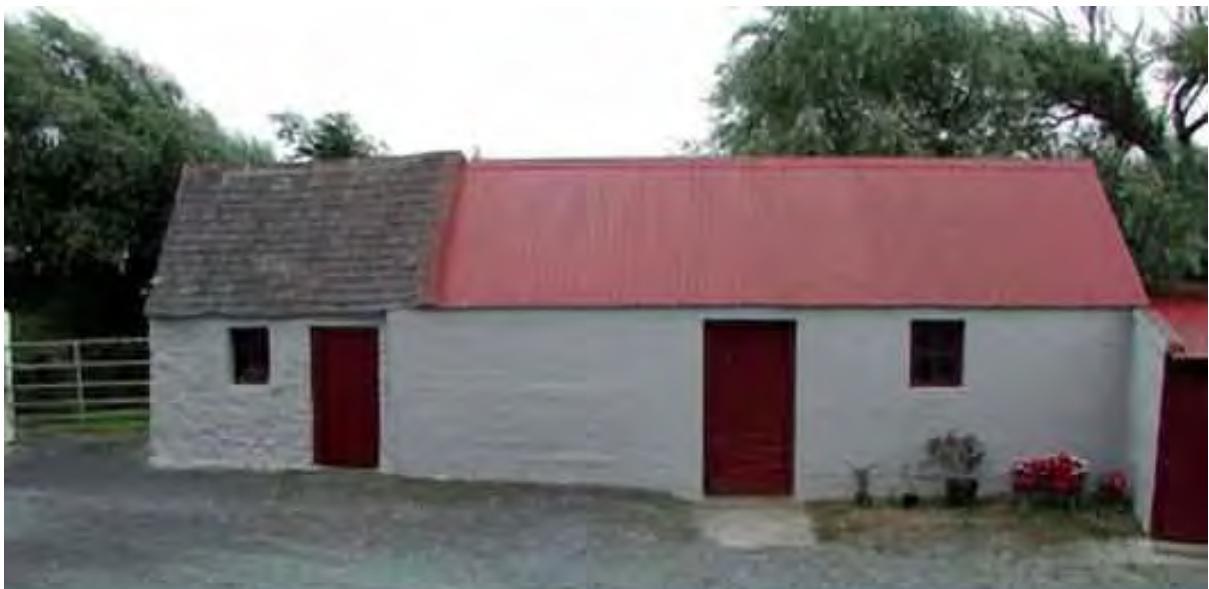
Stone, slate, mass concrete and corrugated iron: farm building, near Tramore, Co. Waterford (NIAH)

The State enacted a thatching grant scheme in 1990 as a house repair measure, rather than as a conservation mechanism per se. The availability of this grant has assisted the retention of many hundreds of thatched houses throughout the country. However, the current value of the grant would benefit from a review.