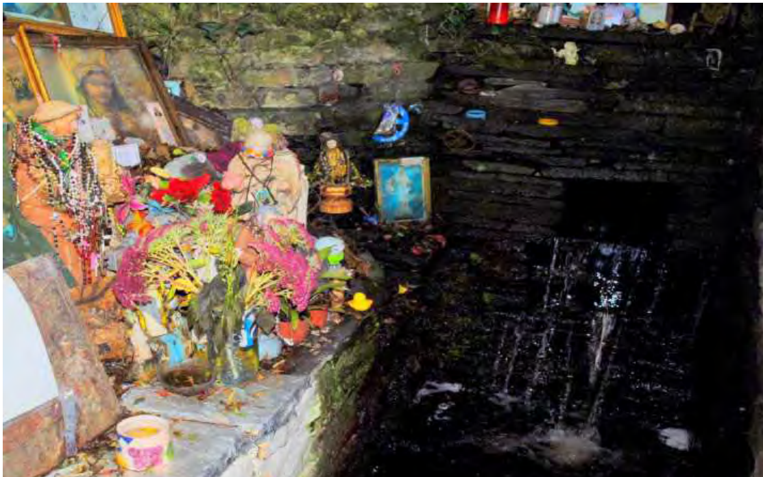
St Brigid's Holy Well, Liscannor, Co. Clare

This intangible cultural heritage, transmitted from generation to generation, is constantly recreated by communities and groups in response to their environment, their interaction with nature and their history, and provides them with a sense of identity and continuity, thus promoting respect for cultural diversity and human creativity.