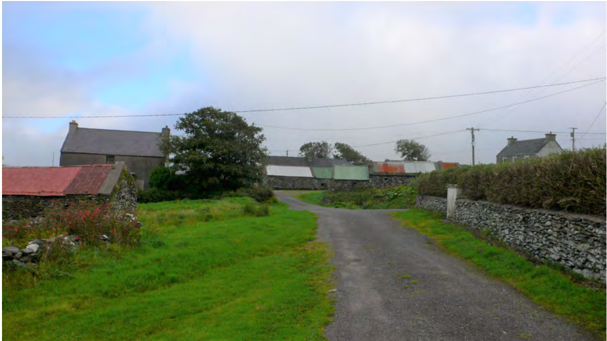
Farm hamlet, comprising parallel lines of houses and outbuildings, near Ceann Trá (Ventry), Co. Kerry