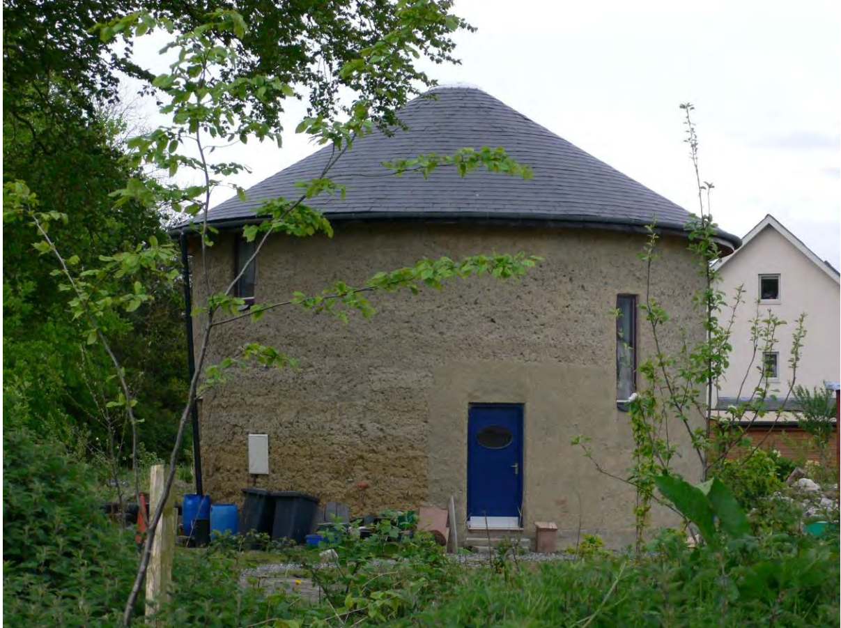
Mud-walled house, built 2010-13, Eco-Village, Cloughjordan, Co. Tipperary (Barry O'Reilly)