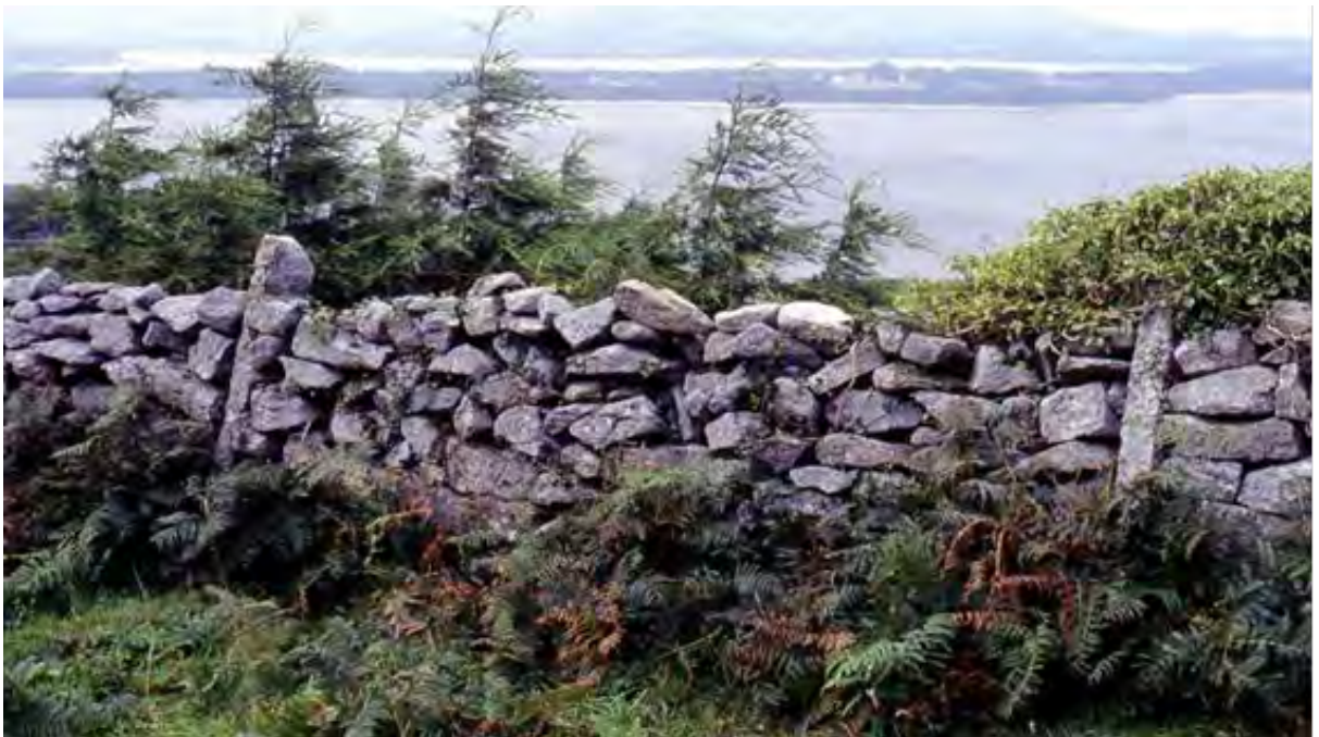
Field boundary, formed from granite uprights and panels of infill, Ballyknockan, Co. Wicklow (Barry O'Reilly)