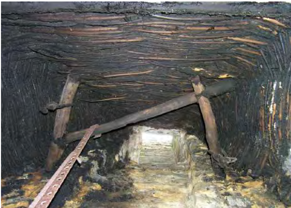
House near Vallemount, Co. Wicklow and its hearth canopy of wattlework (Christiaan Corlett)

However, no large-scale countrywide recording has ever taken place. Vernacular buildings of very modest or plain appearance can contain construction features and materials, and interiors of considerable significance. Sometimes, this only comes to light when a building is collapsing or being demolished. Wicker or wattlework partitions or hearth canopies, often daubed in mud, are an example. The importance and urgency of recording both our rural and urban vernacular can be seen all over Ireland, where buildings are left to decay or are replaced with new structures, almost always without any assessment of their cultural value. Thus, significant information relating to historic, vernacular building materials, methods and many other aspects, is being lost relentlessly and largely without a record being made. It is imperative that this lack be addressed. Much of this work might best be carried out by local people trained up in recording our built vernacular heritage. Indeed, much work in recording tradition-bearers has already been done in this way.