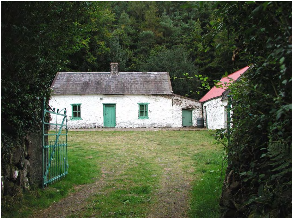
House near Ballymacarbry, Co. Waterford

Popular attitudes, knowledge and understanding of the built vernacular heritage, on the part of the general public, craftspeople and practitioners and regulatory authorities are difficult to gauge, but there is likely to be a wide range of opinion, knowledge and understanding, from hostility and identification of the built vernacular heritage with historically difficult times — overcrowding, dampness and poor lighting — to more neutral sentimentality and nostalgia and on to active enthusiasm and passion. It has been observed that foreign visitors, perhaps more forgiving of past hardships, can have a more enthusiastic view of vernacular houses than Irish visitors to the same place, the latter often perplexed about how someone could live in an old and 'primitive' building.