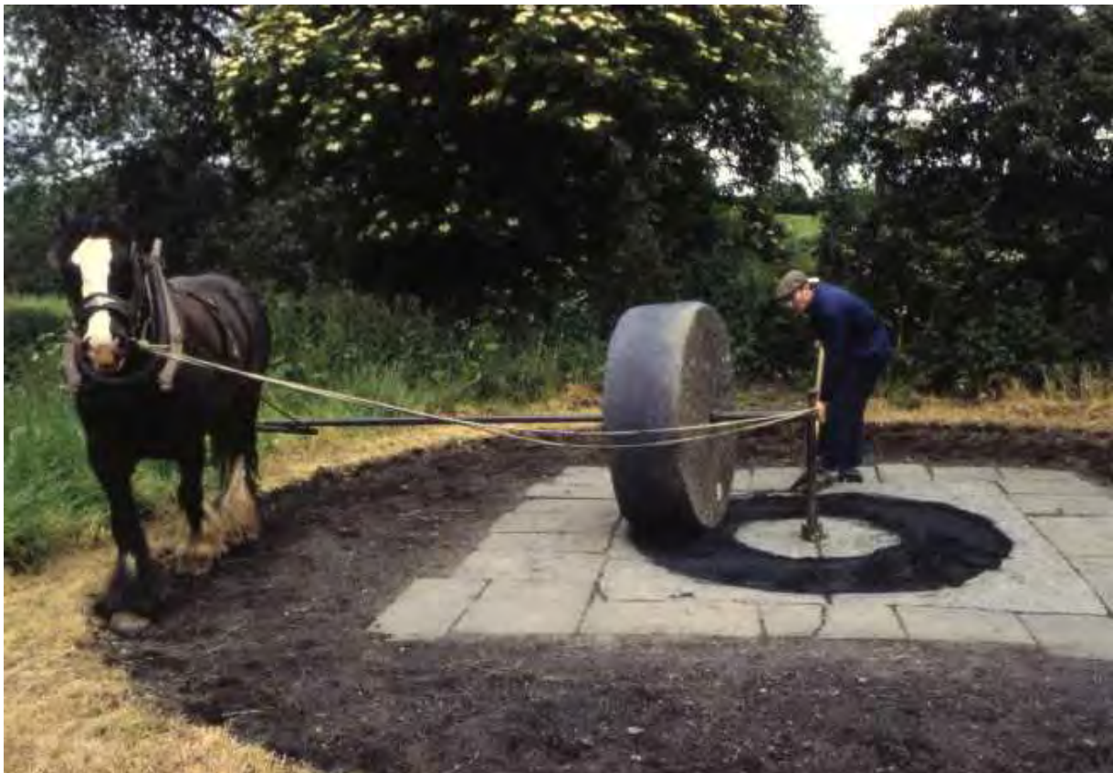
Culm crusher in operation, near Muine Bheag (Bagenalstown), Co. Carlow

One of the many attractive aspects of our built vernacular heritage is the fact that it is strongly local and responds so directly to local climate, topography and environment. Vernacular builders have used locally sourced materials and traditional, local building crafts. Our vernacular buildings, settlements and landscapes are an essential part of the scene – cultural, social, visual and historical. Field boundaries, whether hedgerows, earthen banks, walls or timber fences, may be distinctive of particular regions or districts. A thatched house, a gate made by the local blacksmith, a dugout for a boat at the side of a river, abandoned lazy-beds on a hillside, an old field path, a roadside well, stone walls and old hedgerows, and a great many other structures and features, a forge, a row or urban vernacular houses, all contribute historic quality to their locality and help maintain communal memory. In fact, the vernacular component is frequently the most important contributor to the local scene.