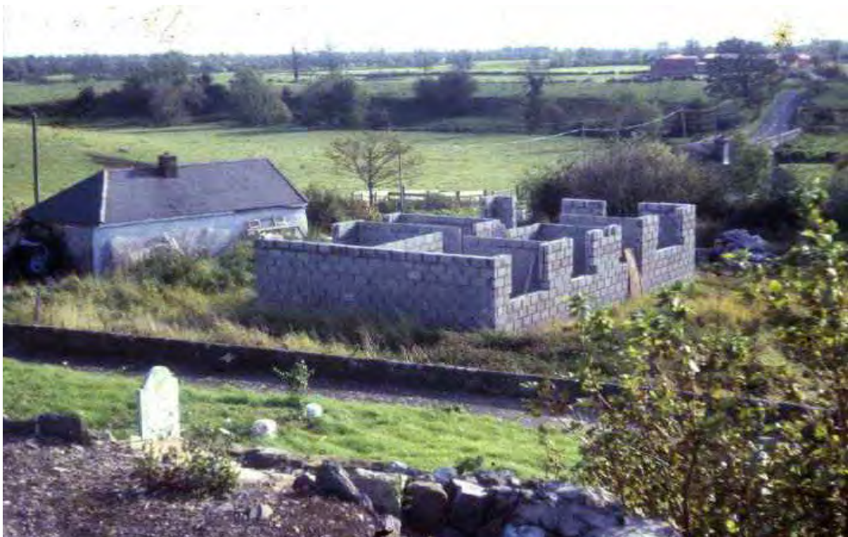
Old house (left, now demolished) and its replacement, near Kilsallaghan, Co. Dublin (Barry O'Reilly)

Reduction in carbon emissions will apply to all buildings, but the potentially negative impacts on historic buildings are recognized, and proposals for retrofitting will need careful scrutiny and advice, as acknowledged in the recently revised Building Regulations (2019), Part L: Conservation of Fuel and Energy (dwellings).