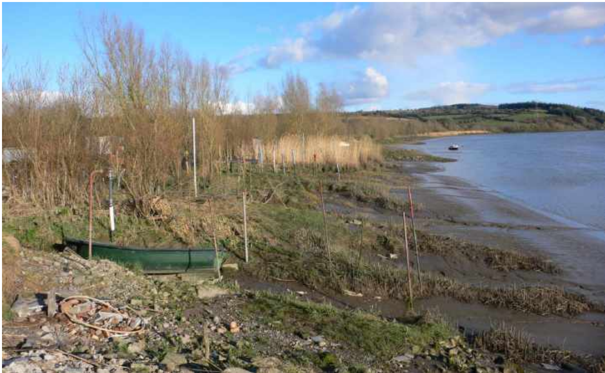
Cuts for boats in bank of River Suir, Ballygorey, Mooncoin, Co. Kilkenny (Barry O'Reilly)

The Council of Europe's 'Convention for the Protection of the Architectural Heritage of Europe' (Granada Convention) (1985) defines architectural heritage in terms of 'monuments (buildings and structures...including their fixtures and fittings), groups of buildings (homogeneous groups of urban or rural buildings) and sites (combined works of man and nature...partially built upon and sufficiently distinctive and homogeneous to be topographically definable)...of conspicuous historical, archaeological, artistic, scientific, social or technical interest.'