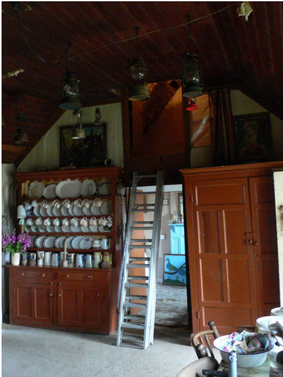
Dresser and food press, near Kilcormac, Co. Offaly (Barry O'Reilly)