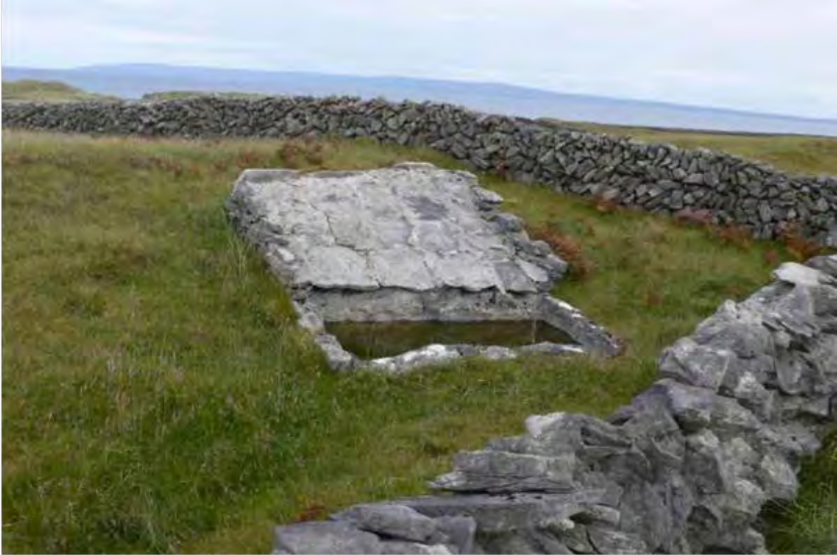
Limestone-built water collector and field walls, Inis Meáin, Co. Galway

Back cover photograph: Conservation of mud-work at Kirwan farmstead, Mayglass, Co. Wexford, c.2000