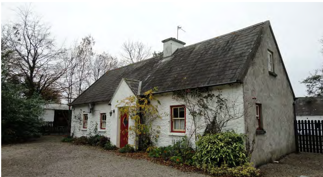
Holiday rental, near Dundrum, Co. Tipperary (Barry O'Reilly)

A network of vernacular houses for holiday and short-term letting could also reduce development pressure for new holiday house construction. Such an approach could be piloted in selected regions or local areas and could create a sustainable market for repairs and conservation, supporting labour-intensive craft skills and local economies.