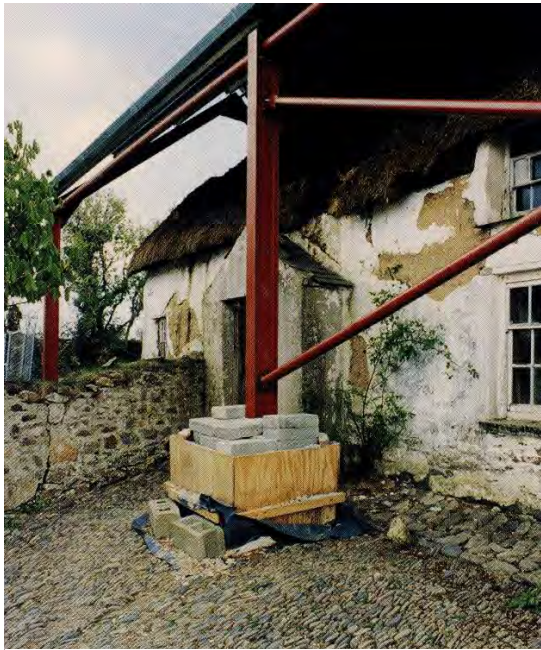
A temporary protective shed was erected over the building to facilitate conservation works