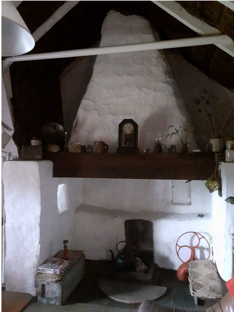
Hearth with jamb wall, Portally, Co. Waterford (Barry O'Reilly)

Vernacular houses were and, in some places, continue to be the setting for many folk customs and traditions, particularly the celebration of the significant days of the traditional calendar. An example is the making of St Brigid's Crosses: on the saint's feast day the old cross was placed in the underside of the thatch and the new one placed over the inside of the front door. In some districts, mumming (a play based on death and rebirth) is performed in local houses at Christmas.