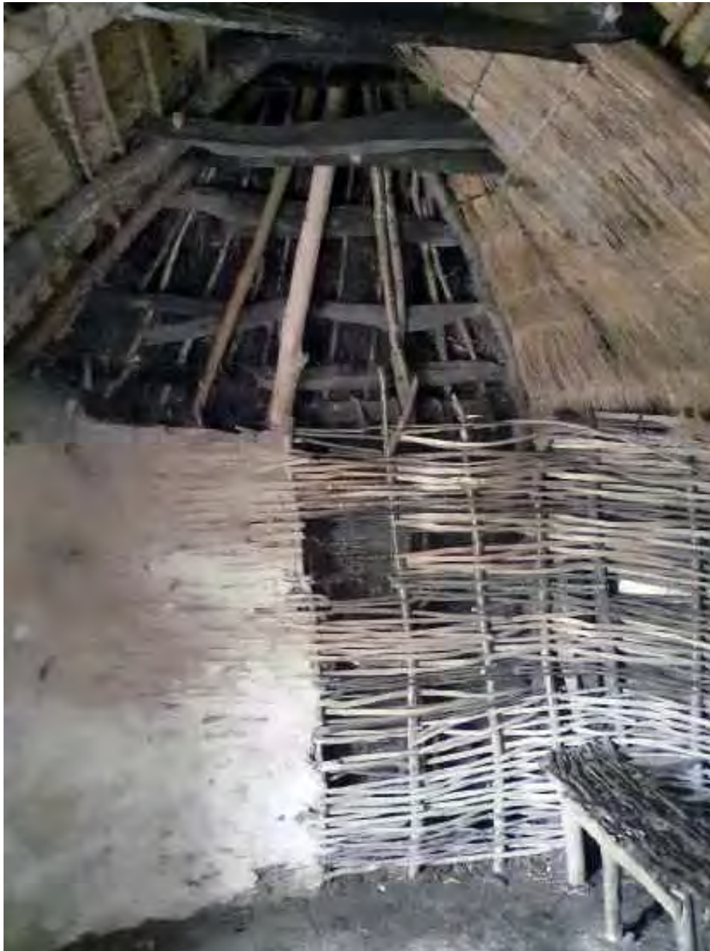
Experimental vernacular construction, National Museum of Ireland (Country Life), Turlough, Co. Mayo. Such materials and techniques can be traced back to the buildings of our earliest ancestors.

Our built vernacular heritage should also be seen as culturally characteristic of all of Ireland; historically, the lived experience of people in Kerry would have been similar to that of their counterparts in Antrim. Our built vernacular heritage, while apparently distinctively Irish, shares some elements with other parts of Atlantic Europe, notably Scotland, but also parts of Iberia and Scandinavia.