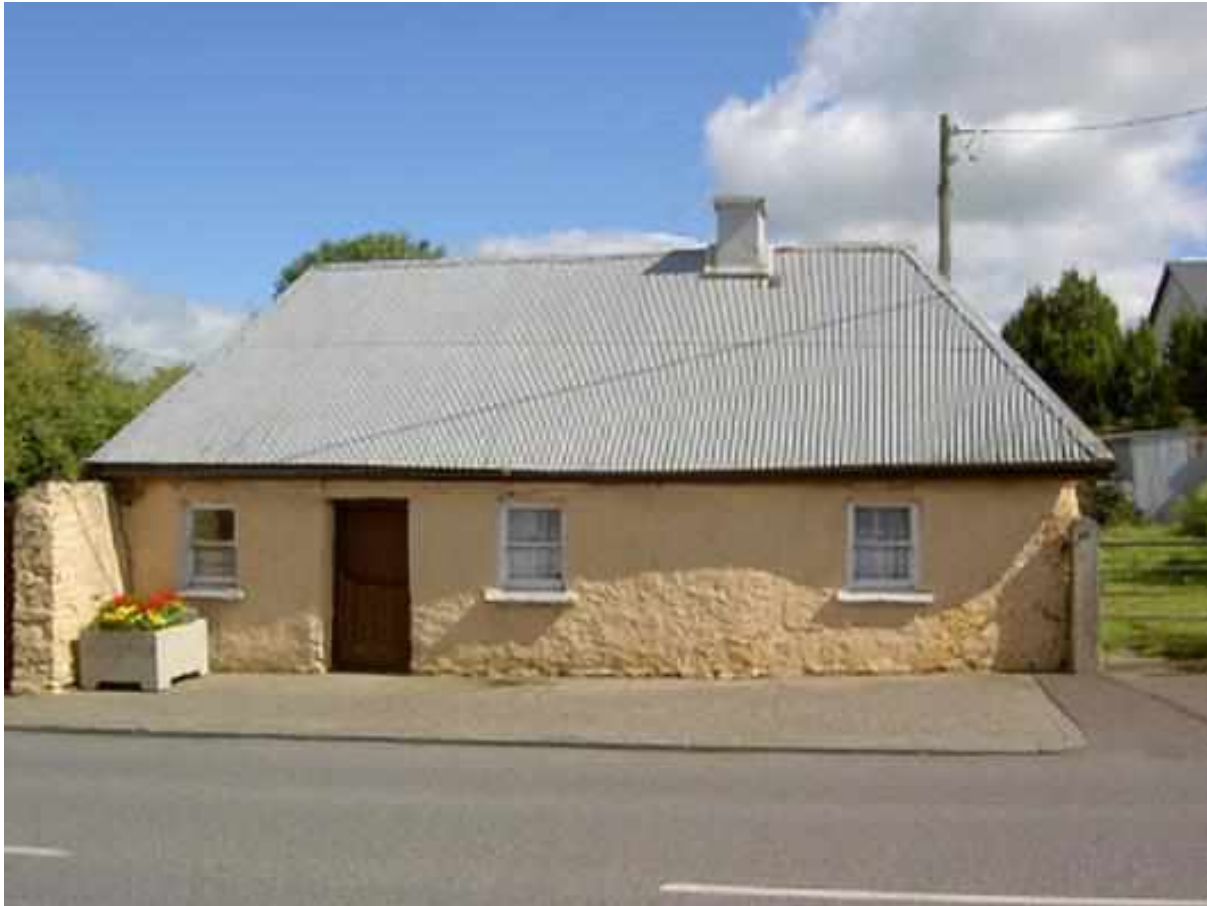
House at Newtownshandrum, Co. Cork (NIAH)

Grant aid programmes for architectural conservation accompanied the coming into effect of the Planning and Development Act (2000). The Built Heritage Investment Scheme (2014), administered by the local authorities, and the Historic Structures Fund (2015), administered by the Department of Housing, Local Government and Heritage, with both funded by the Department, have benefited many vernacular buildings, but generally only those that are protected structures. A recently added sub-programme of the latter scheme was established specifically to assist owners of vernacular buildings that are not protected structures.