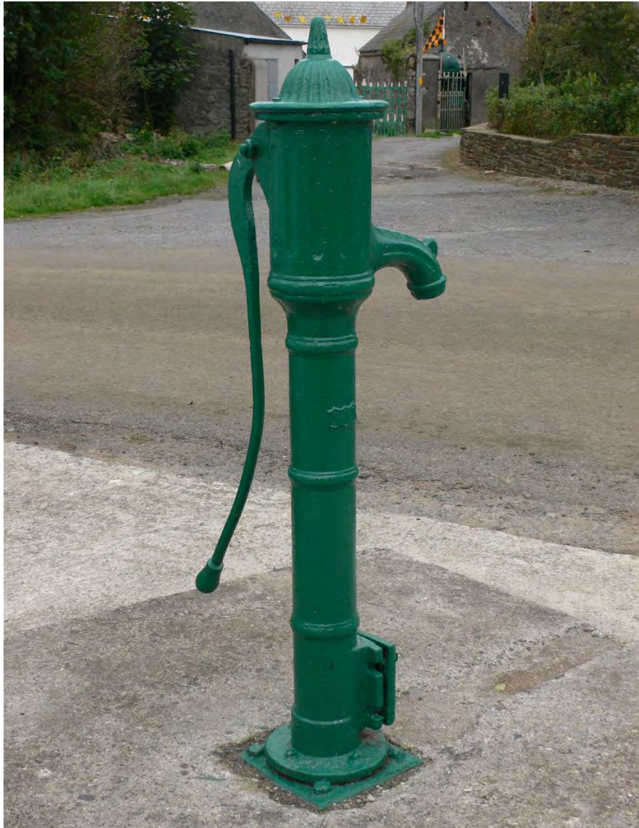
Water pump, Ballygorey, Co. Kilkenny. Though produced in foundries, such pumps became an essential part of the local scene

Vernacular houses were also formerly a strong feature of Irish urban areas. The large-scale Ordnance Survey maps of 1847 for Dublin City indicate long rows of mud cabins along some of the roads on the northern outskirts, now long since vanished. However, most smaller towns and villages still have examples at the edges of what had been their cores in the nineteenth century. Most of these survivors are significantly altered and often do not look particularly vernacular. Derelict examples are usually better preserved and can retain features of considerable interest, such as thatched roofs under corrugated iron. The north County Dublin towns of Skerries, Rush and Lusk, and some of the villages, are notable for having cores that are still substantially vernacular.