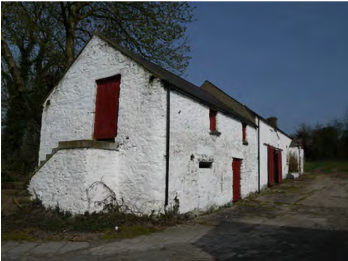
Farm buildings near Magheracloone, Co. Monaghan (NIAH)

Learning about Irish history and life through the medium of our buildings and landscapes can be exciting and stimulating. The 'idea of Ireland' – a place where tradition is strong and whose landscape is relatively 'unspoilt' – is enduring, but not inaccurate. Museums, heritage centres and, perhaps especially, folk parks, are not only tourism attractions but, critically, have an educational purpose – the important task of portraying Irish life, history and heritage in an accurate and authentic way. Such centres could also be places where vernacular building skills and vernacular ideas could be actively communicated and taught.