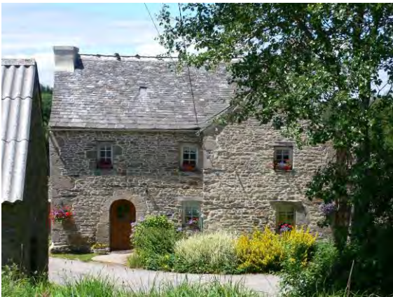
Farmhouse at Mougau Bihan, Finisterre, Brittany