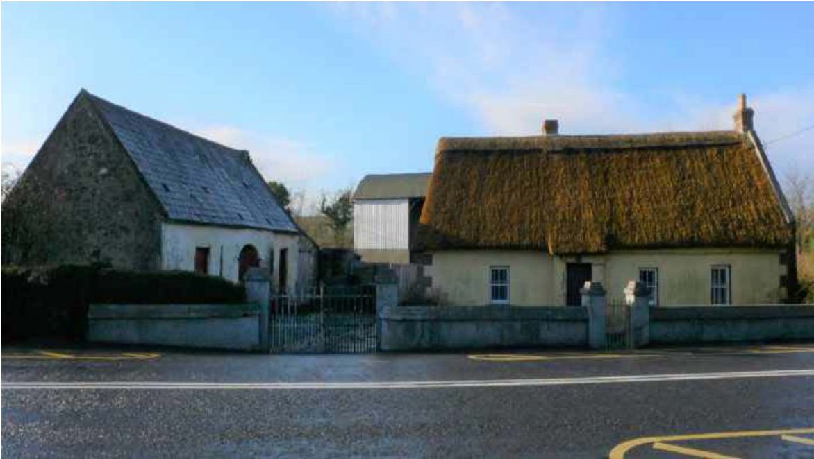
Farmyard at Oola, Co. Limerick, displaying a range of vernacular buildings, features and materials

Most actions will have a designated partner(s) and contributors, which will allow the strategy to benefit from the pooling of resources, skills and experience.