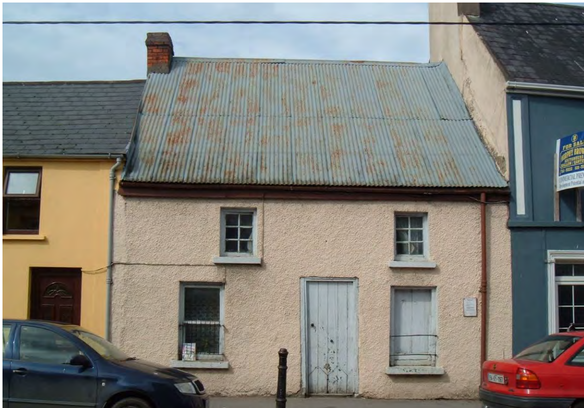
Urban vernacular house, Percival Street, Kanturk, Co. Cork