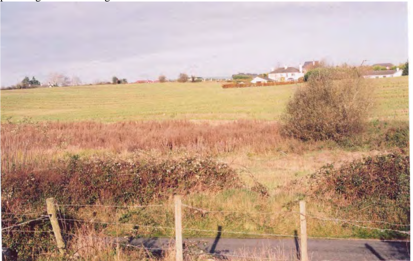
Plate 12. An area of damp ground, now dominated by wet grassland and weedy vegetation, occurs in the field to the east of Lough Macask. This was probably formerly a wetland connected to Lough Macask.