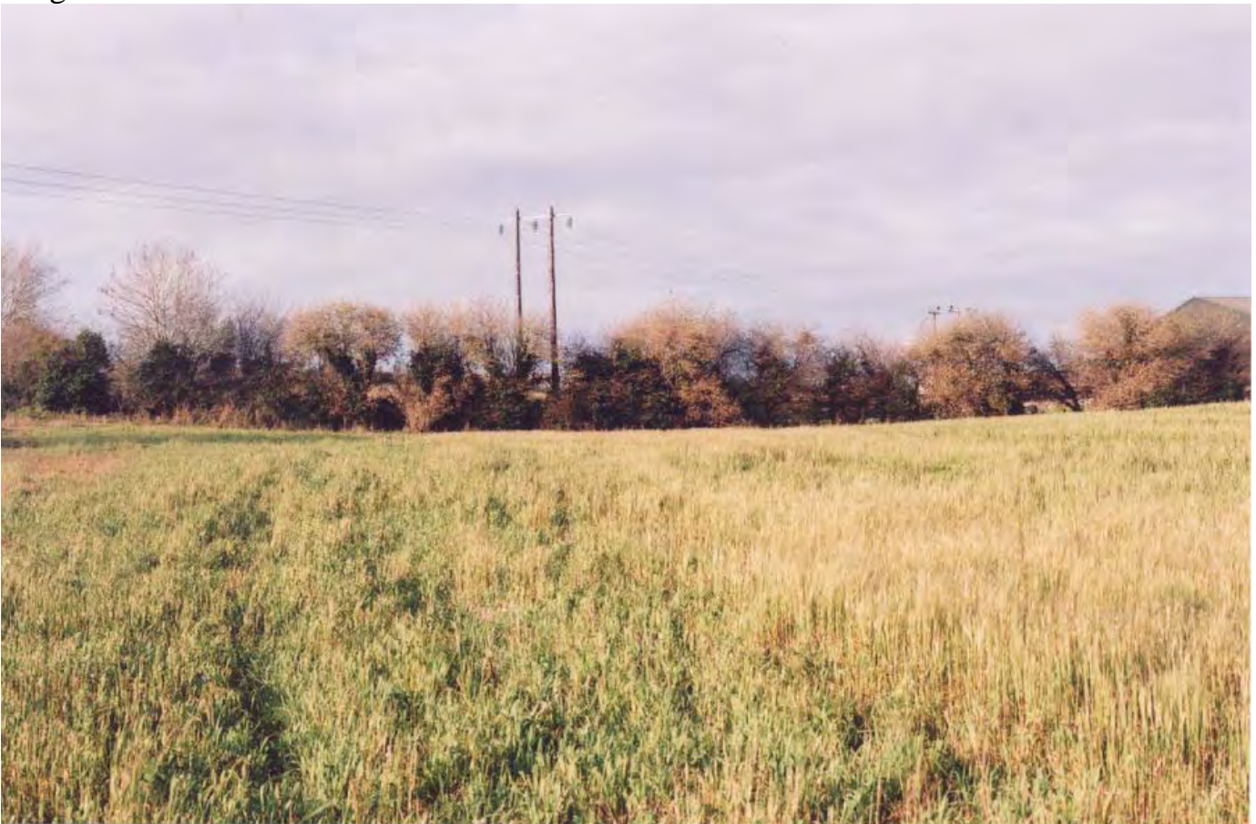
Plate 4. Hedgerows along part of the north-western boundary are intact and of moderate quality. View is from arable field east of Lough Macask.