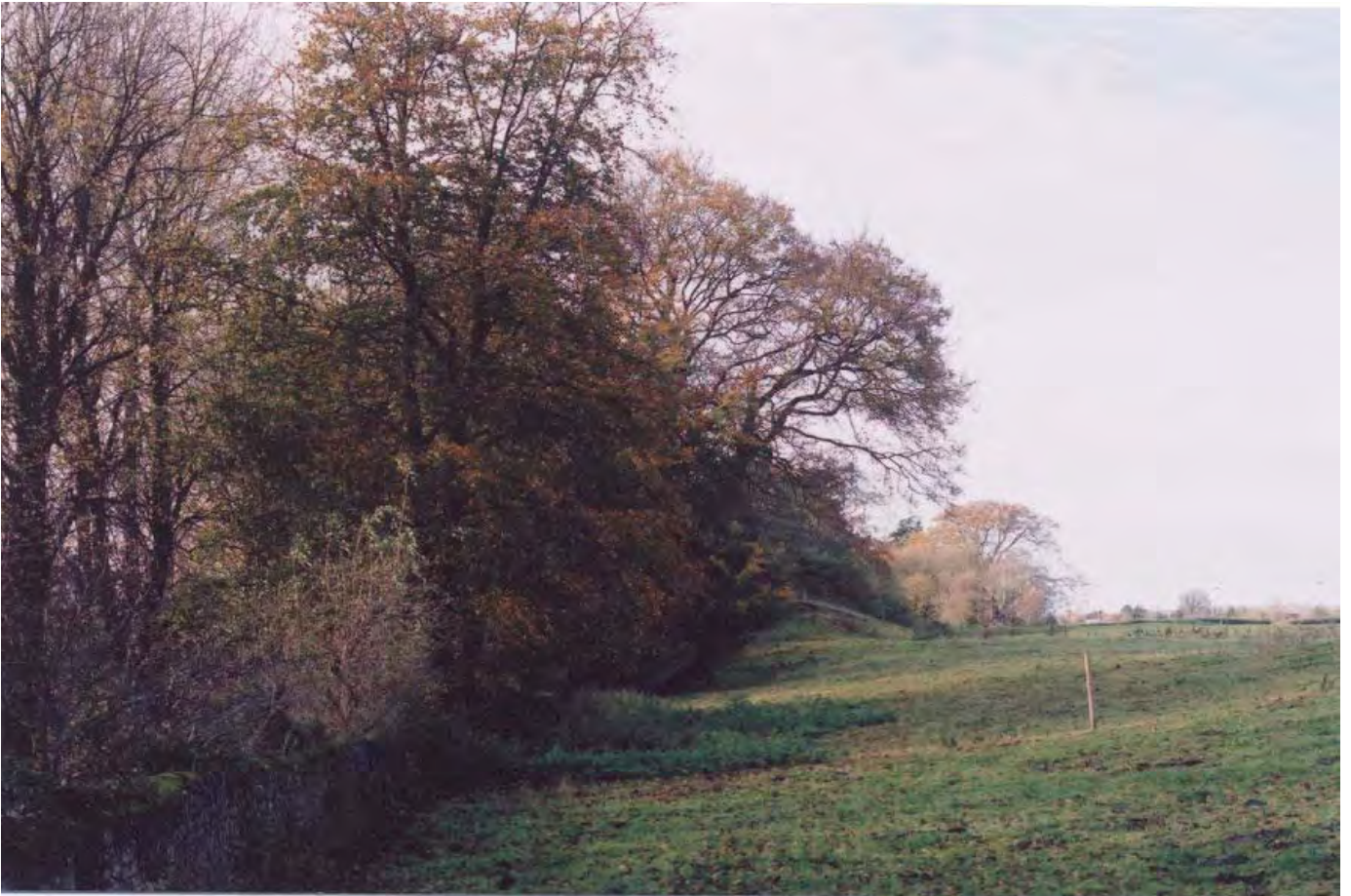
Plate 5. Tall, mixed woodland skirts part of the southern boundary of the study area. This is on the sloped ground above the adjoining river.