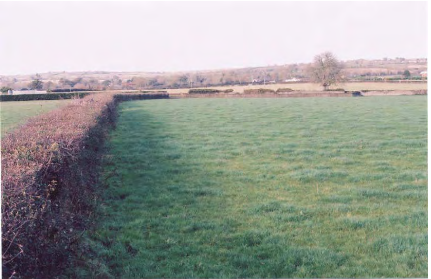
Plate 1. The Bishops Demesne/Kilcreen area is dominated by improved agricultural grassland. Hedgerows are low and well maintained.