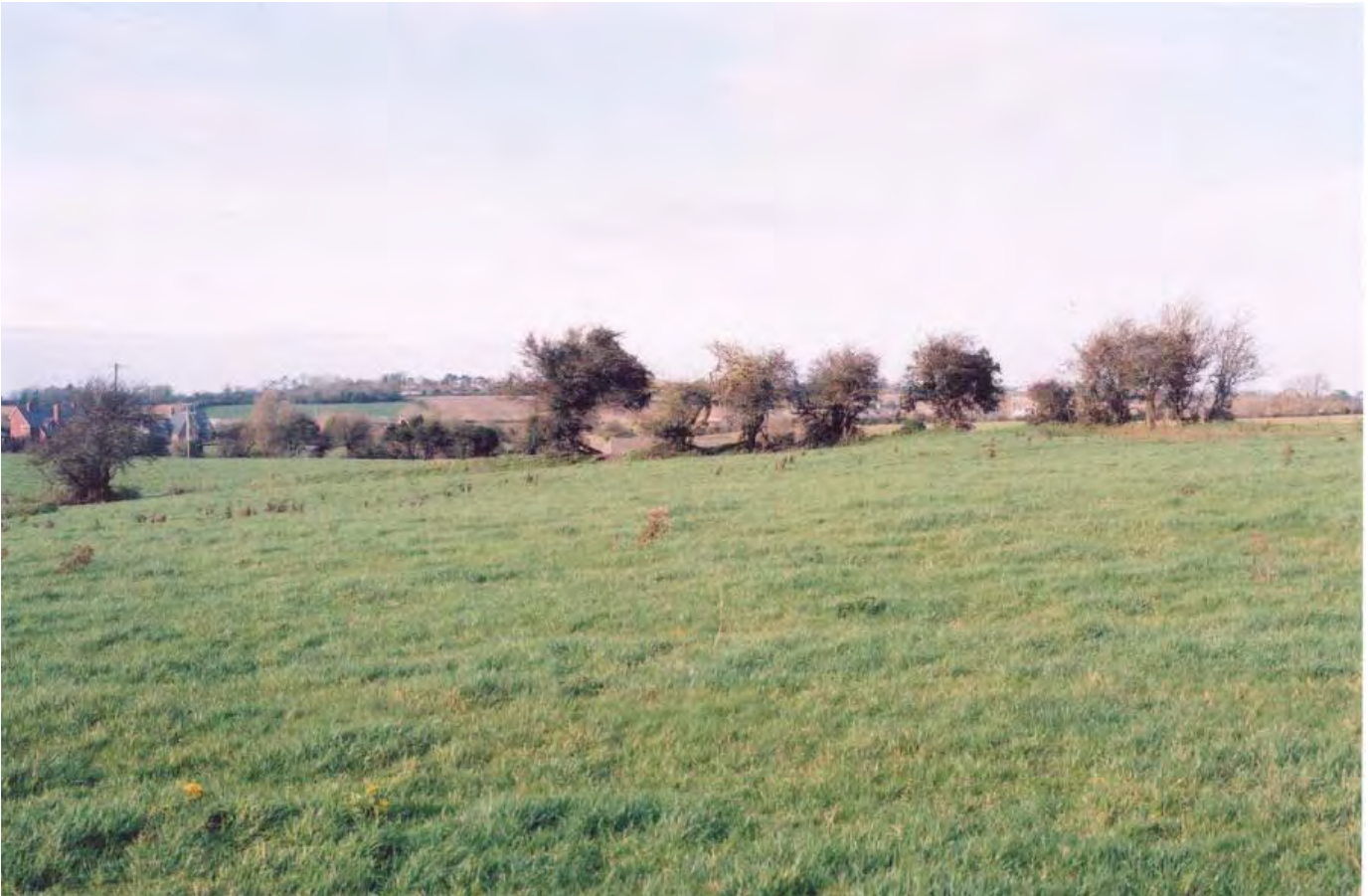
Plate 3. View is of intensively managed grassland in the Lough Macask area where hedgerows are often mere remnants.