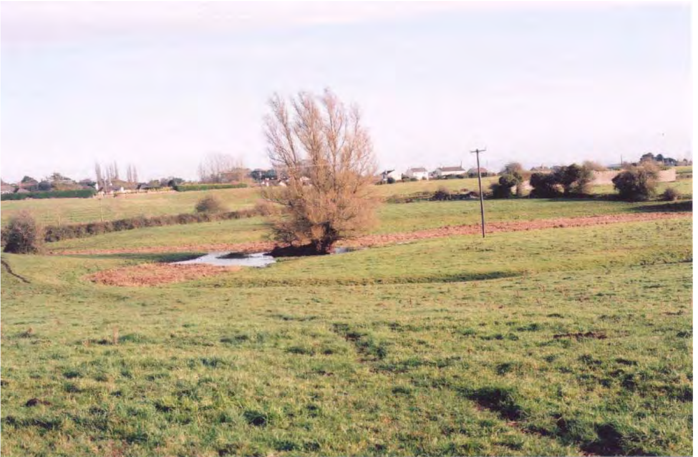
Plate 9. Lough Macask is a small eutrophic lake within a grassland field. View is of eastern basin showing large willow tree and swamp vegetation within lake.