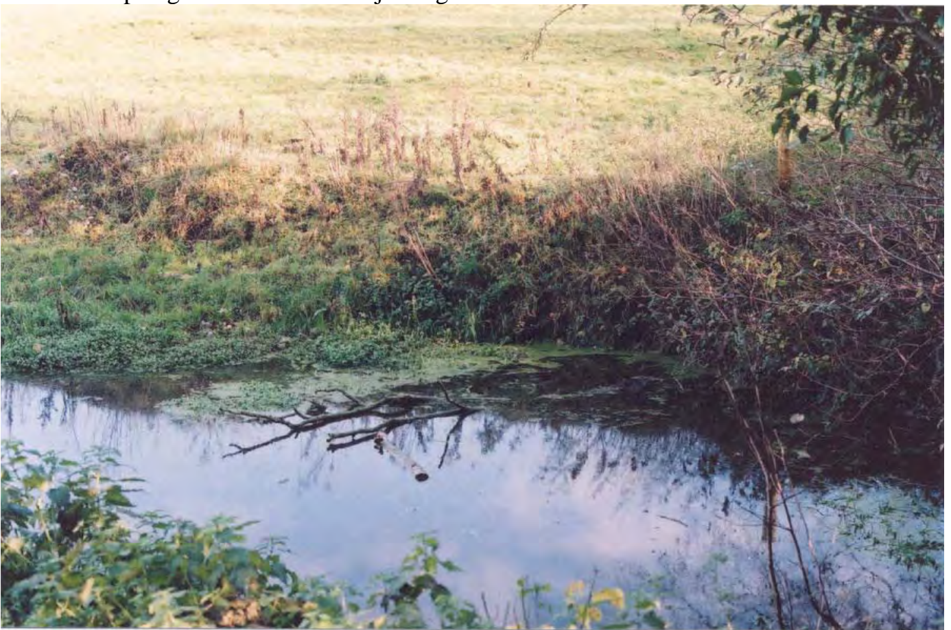
Plate 6. A small pond occurs along the southern boundary. This is of minor ecological interest.