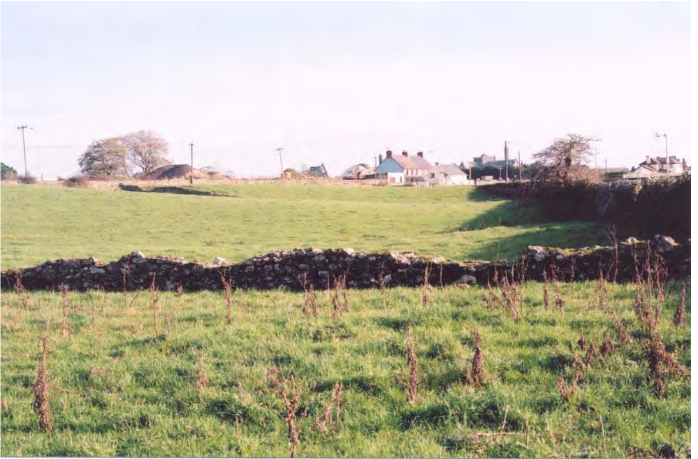
Plate 7. Walls, including old stone walls, form some of the field boundaries. View is from south of Lough Macask looking south-eastwards.