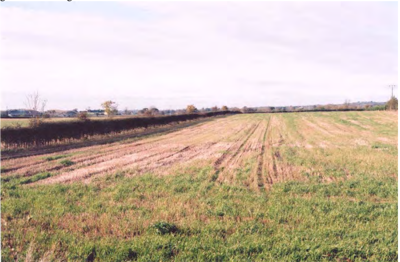
Plate 2. Arable farming is a feature of the study area. Several fields were in stubble at the time of survey. View is of a large field at Kilcreen.