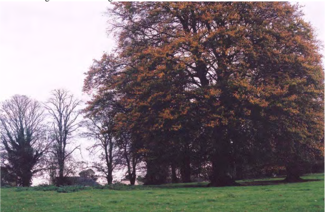
Plate 8. Ayrfield House is set in typical parkland, with tall, mature trees of beech, lime and horse chestnut.