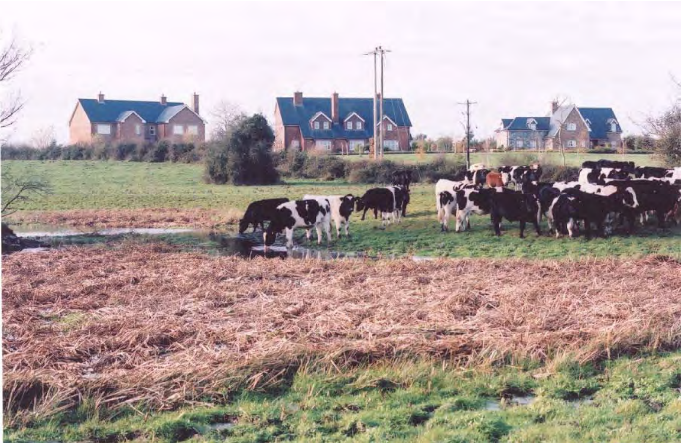
Plate 11. Cattle have unrestricted access to Lough Macask and have caused severe poaching around the edges and nutrient enrichment.