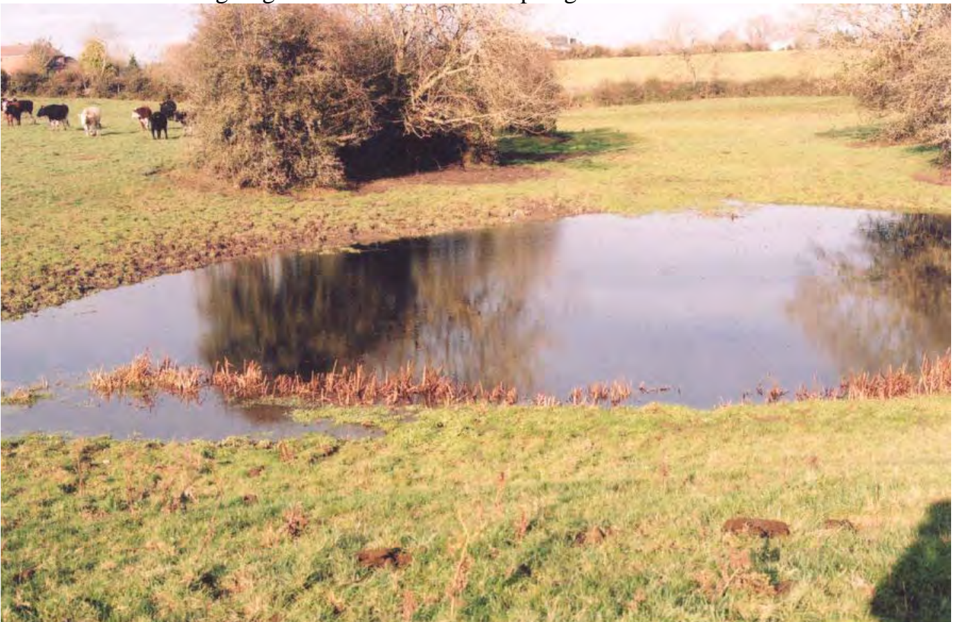
Plate 10. View of western basin of Lough Macask.