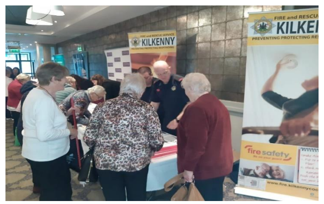
Fire Personnel giving fire safety advice at the Kilkenny Older People's Council celebration in the Kilkenny Ormonde Hotel.

Stations despite the inclement weather conditions.