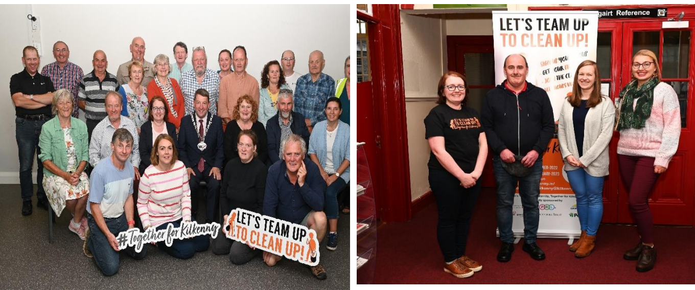
Tidy Towns Forum in Ballyragget