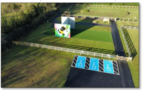
Aerial view of Ball walls with dedicated Dog Friendly Zone in background