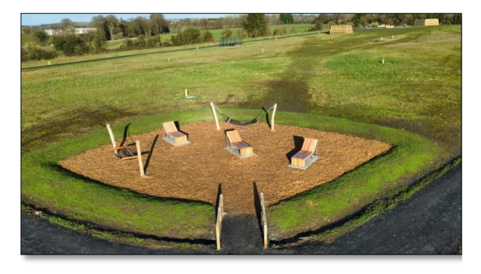
Aerial view of novel relaxation break-out spaces

The new Park, which was approved planning back in 2021, sees an investment of c.€1.2 million into Kilkenny's newest large scale amenity offering. The funding to deliver this project was secured from the Department for Rural and Community Development, under the Outdoor Recreation Infrastructure Scheme (ORIS) and the Community Recognition Funds, along with Sports Capital funding and the Council's own funds.