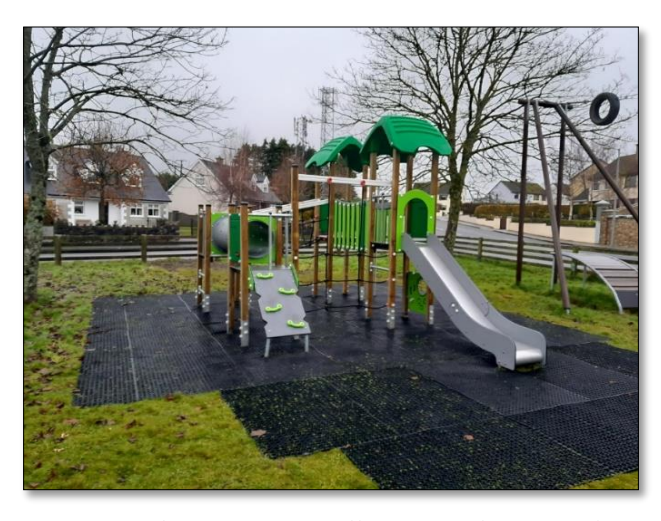
New Play Tower in Ballyragget Playground

checks to complement our own in-house weekly and quarterly inspection regime. The importance of same is to highlight any issues which require attention to ensure continued safe play. The Parks staff also continued with general maintenance during the month.