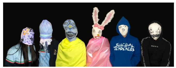
Self-portraits created by participants of the Artist in Residence – Youth Art

https://www.youtube.com/watch?v=2t0i9ODEa-w