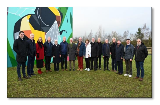
Opening of the Kilkenny Countryside Park – 15<sup>th</sup> December 2023

loungers along with Kilkenny' s first dedicated dog-friendly enclosure.