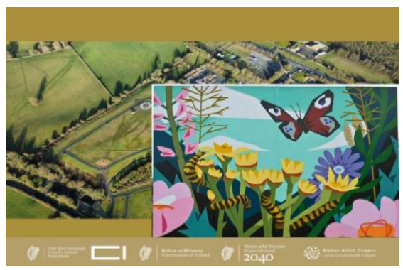
Mural at Kilkenny Countryside Park at Dunmore

The official opening of the Kilkenny Countryside Park at Dunmore took place on Friday 15<sup>th</sup> December, 2023. The striking entrance welcomes you with a biodiversity themed mural funded by the Creative Ireland scheme. The park includes trails for walking, running, cycling, and orienteering, along with opportunities to learn about nature and biodiversity.