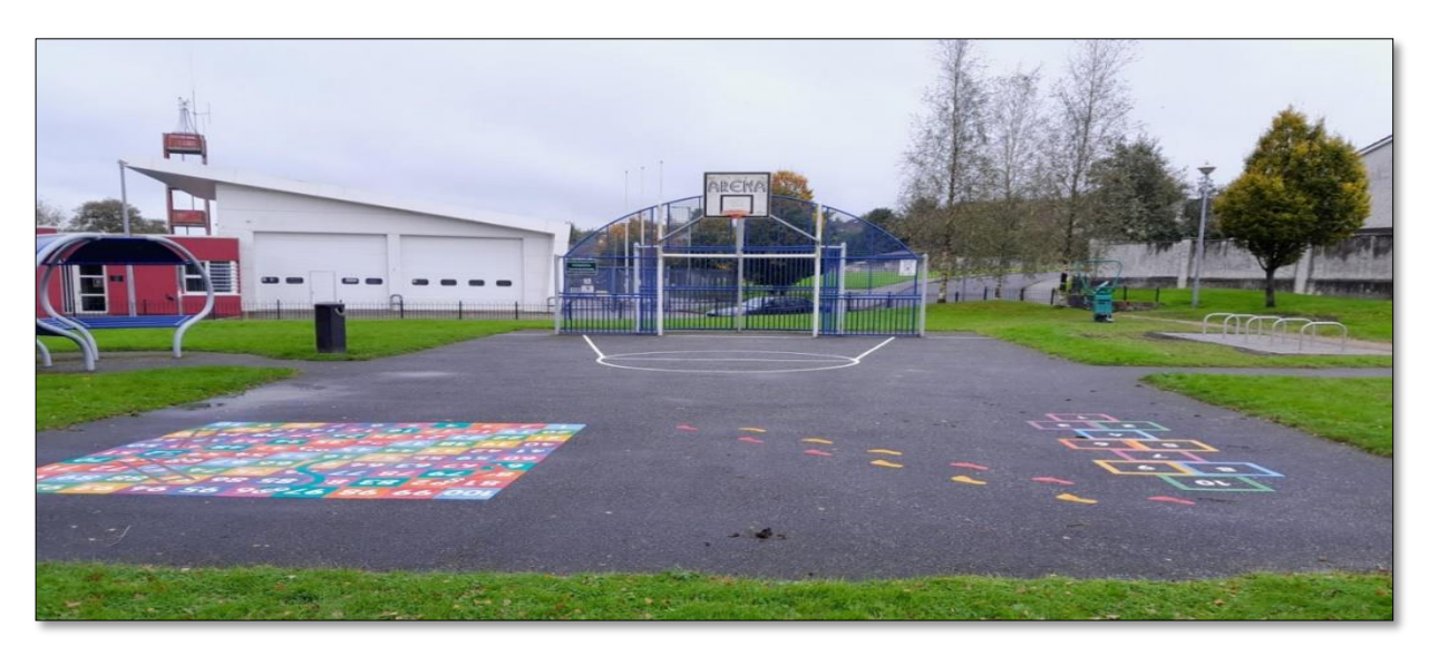
Enhancement Works completed in Castlecomer MUGA

In the playground in Mooncoin, a new wheelchair accessible roundabout and associated soft surfacing was installed. The cost of same was funded by the Department of Children , Equality, Disability, Integration and Youth's under the Play and Recreation Grant with match funding from the Council's own funds.