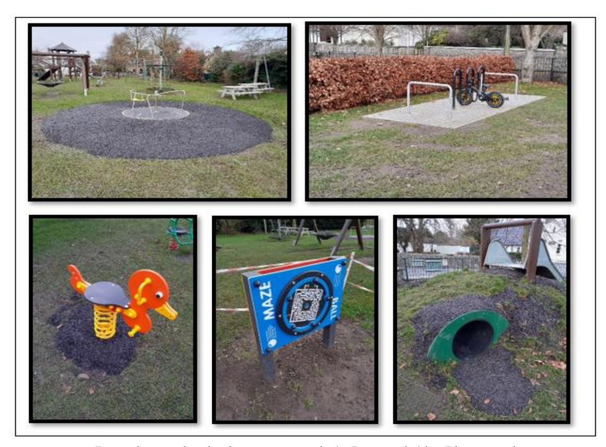
Recently completed enhancement works in Bennettsbridge Playground

Funding to deliver this project includes grant funding secured under the Sports Capital Programme, Specific Development Contributions and the Council's own funds.