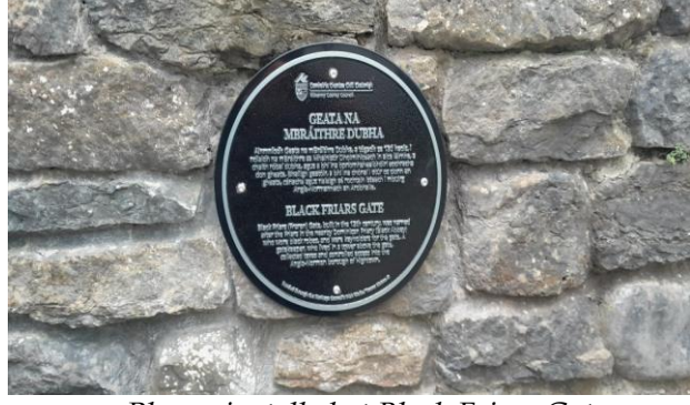
Plaque installed at Black Friars Gate

Information plaques have been installed on five additional sections of the Kilkenny City Walls. The locations are as follows: Troy's Gate; Black Friars Gate; Black Abbey Carpark; Ormond Road and Ormond Street. The project was funded jointly through a grant award from the Heritage Council's Irish Walled Towns Network and the Heritage Office of Kilkenny County Council. This is Phase 1 of larger project to develop a trail around Kilkenny's City Walls. Phase 2 will involve installation of further interpretation, and development of a trail route and information.