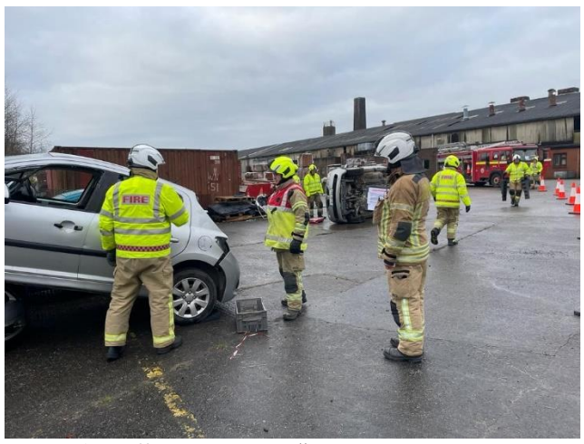
Road traffic exercise on "Managing Fire Service Incidents – Module 1"