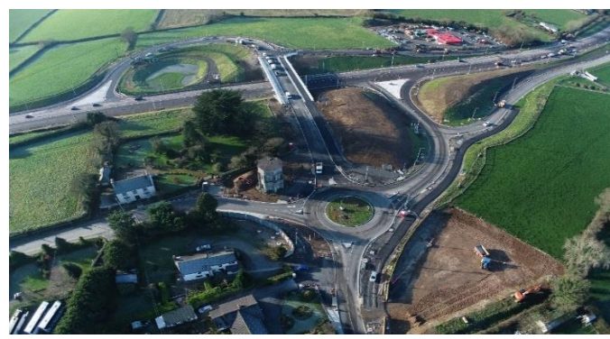
Overhead drone footage of the compacted grade separated junction under construction (N24)

Works are continuing to progress well. Works are nearing substantial completion.