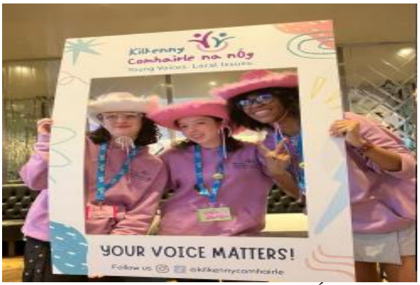
Members of Comhairle na nÓg

The Community section supports the role of Comhairle na nÓg in Kilkenny. Over 100 young people from secondary schools and community groups from County and City had the opportunity to express their opinions and contribute to discussions on youth matters at the Annual Youth Conference held in Langton House Hotel on the 24<sup>th</sup> October, 2023. It was a great opportunity to gain valuable insights on diversity and inclusion and other youth-relevant matters which will form the basis of the work undertaken by Comhairle in Kilkenny.