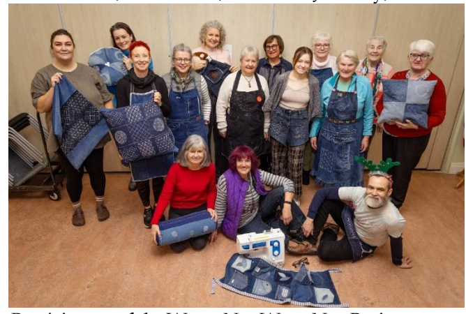
Participants of the Waste Not Want Not Project

Waste Not Want Not, a climate action community project in partnership between Kilkenny Arts Office and Vincent's shop Kilkenny to utilise their waste streams and encourage the public to reuse and to buy second hand. Over six weeks, participants unleashed their inner creativity, turning worn-out denim into unique creations such as aprons, bags and cushion covers as well as learning the beautiful art of Sashiko and Boro stitching techniques. The project afforded participants the opportunity to chat about the positive impact individuals can have on through climate action initiatives and the power of collective action. The beautiful work created can be seen in the window of the new Vincent's shop, Butts Green, R95 VK7X, until 14th January, 2024.